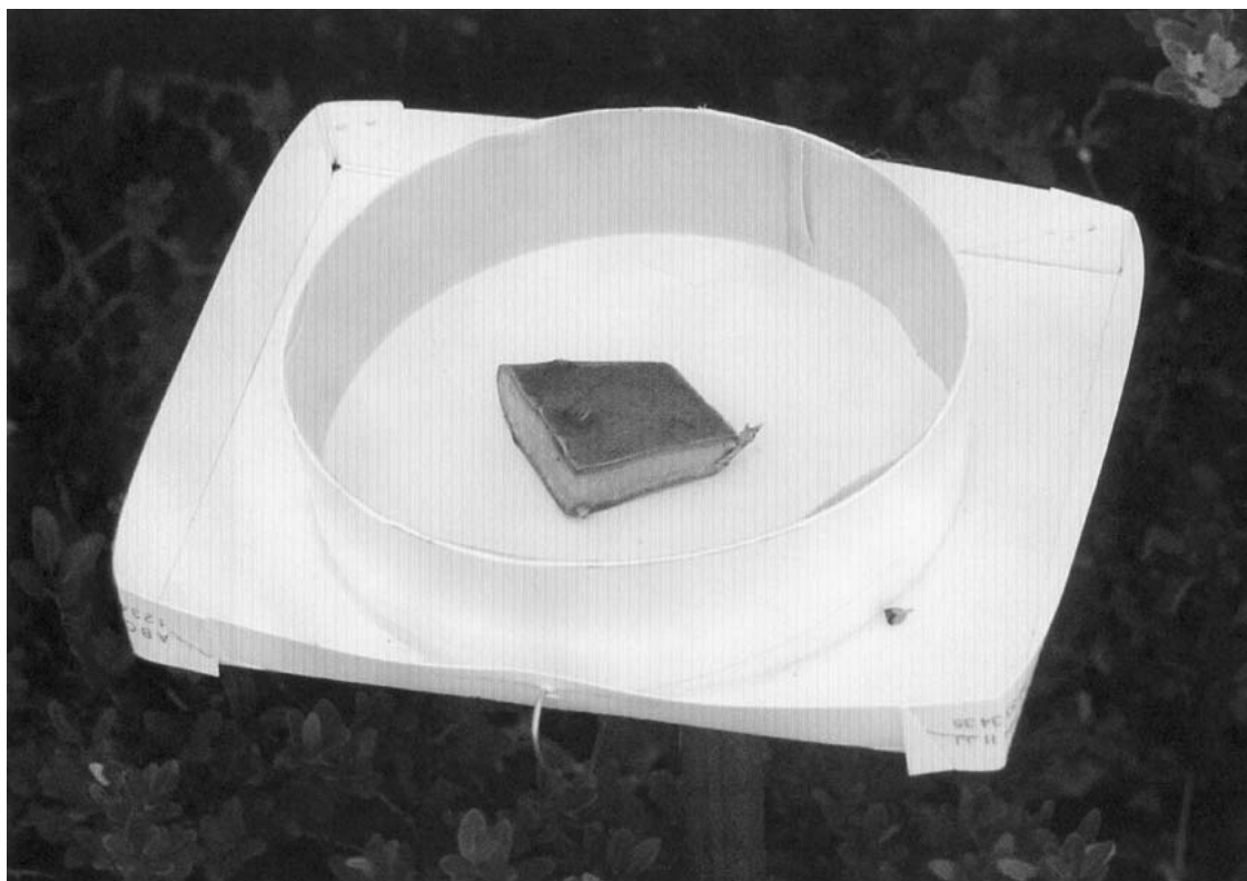
Fig. 1. Small mating table used in determining courtship and mating behaviors at St. Marks National Wildlife Refuge (7 July 2003) and Alligator Point, FL (8 July 2003), and determining precise timing of mating events at Alligator Point (15-18 July 2003).

Mating tables were set-up in the same fashion for each set of observations. A small ( 2 \times 2 cm) section of O. stricta was placed in the middle of the mating arena of each individual table. One, clipped-wing, virgin female C. cactorum was released into each arena. In communal tables, several cladodes of fresh O. stricta were placed inside the arena and 7-12 clipped-wing females were placed in the center of each mating arena. Time of female deployment varied for each experiment. All times reported are in Eastern Daylight Savings Time on a 24-hour atomic clock.