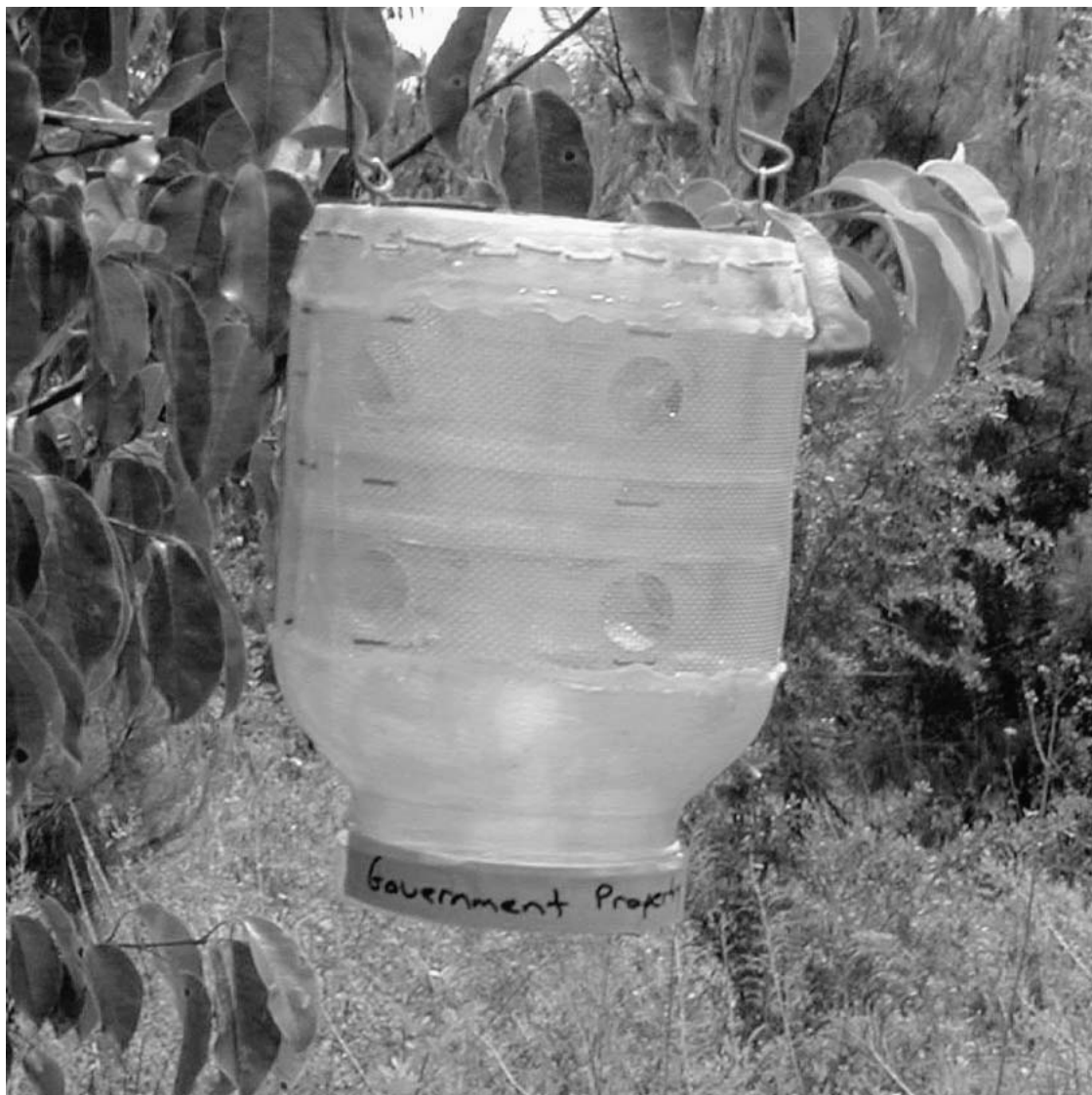
Fig. 1. Funnel trap.

1988). Overwintering adult captures from the first trap catch in 2002 through 29 April 2002 revealed a male:female of 1:1. Similarly, overwintering adult captures from the first trap catch in 2003 through 28 April 2003 revealed a male:female of 1:1. Adult tachinids, most likely the endoparasitoid Hemyda aurata Robineau-Desvoidy, were only captured on three occasions.