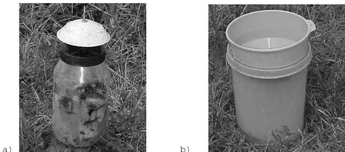
Fig. 1. Traps used for capturing the tuberoses black weevil S. acupunctatus : a) Victor trap, and b) Funnel trap.

Fieldwork was conducted from August to October, 2001, in Morelos, México (18°53'N-99°11'W) at an altitude of 1350 m. A 1.2-ha parcel planted with offshoots of P. tuberosa was used as an experimental field and was divided into 18 plots (28 × 35m), with one trap placed in the center of each plot. A two-factor design (two trap types and two bait types) including six treatments and three replicates was used. The traps evaluated were the Victor (V) trap made of transparent plastic measuring 9 × 16 × 7 cm (depth:height:width) with a black cap having four 1 cm-diameter orifices at its base and with a yellow umbrella-shaped cap measuring 7 cm in diameter (Fig. 1a) and a yellow