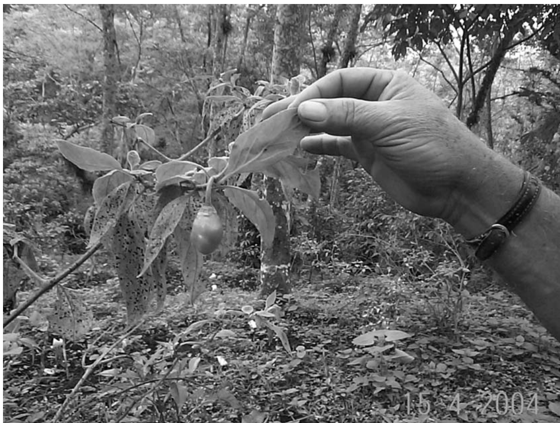
Fig. 2. Manzano pepper plant in a coffee finca at Ixhuatlan de Cafe, Veracruz where the infested peppers originated.

ecological, then manzano peppers may be more susceptible to infestations than other commercial pepper varieties. If so, this information is relevant to quarantine and import inspection protocols.