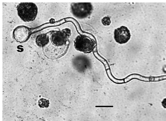
Fig. 2. Entomophaga grylli pathotype 1 walled, septate, empty hypha originating from now empty spherical cell. Bar = 35 microns.

The species of the Entomophaga grylli complex that are fastidious grasshopper and locust pathogens have not been reported to complete their life