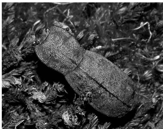
Fig. 1. Habitus of a live specimen of V. aequalis from Tlaquilpa, Veracruz, Mexico.

This interpretation is supported by the distribution range of specimens we have studied, from several localities of the State of Oaxaca including some in the vicinity of Cerro San Felipe. However, the distribution of V. aequalis is not narrowly restricted, but ranges through a great portion of the mountains of northern Oaxaca, along the Sierra Aloapaneca, Sierra Mazateca and Sierra de Juárez, including a small area in the neighboring mountains of Veracruz (Fig. 2). The latter locality represents a new record for the state of Veracruz.