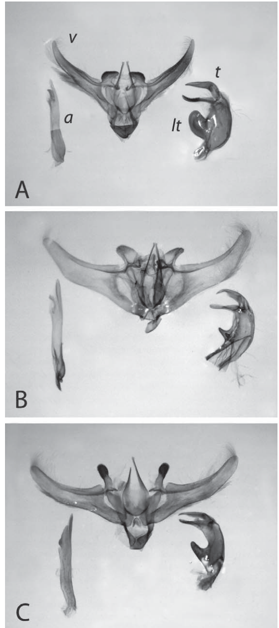
Fig. 2. Male genitalia: A) Diatraea saccharalis , B) D. indigenella and C) D. tabernella (a = aedeagus (= phallus); v = valvae; t = tegumen; lt = lateral tegumenal lobes).

cifics concerning the locality were not provided. Also, D. tabernella was noted near the municipality of Condoto, Department of Chocó, not far from the locality where D. tabernella was collected in Cartago. Later, Box (1959) mentioned that D.