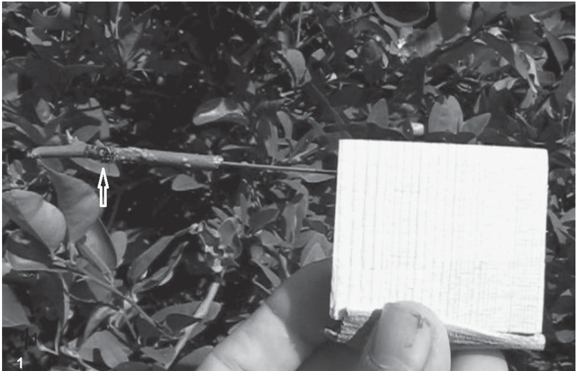
Fig. 1. Brachygastra mellifica (indicated by the white arrow) feeding on Diaphorina citri on a lemon petiole secured with a short length of wire to square wood block.

practically passed over as a prey (Table 1). The time taken to consume 1 of these very immature developmental stages was 6 \pm 1 seconds (Fig. 2). In contrast when B. mellifica wasps were exposed to 2nd and 3rd instars a great increase in consumption per wasp occurred. Thus individual wasps consumed up to 42 second and third instar nymphs, and spent 17 seconds to predate each one (Fig. 2). Further one wasp was able to consume up to 27 fourth or fifth D. citri instars in 14 min, averaging 31 \pm 2 seconds per nymph (Fig. 2); in some cases up to 37 seconds were required to consume 1 nymph, but others were consumed in less than 20 seconds. On most occasions B. mellifica consumed the entire prey. These developmental stages most preferred by B. mellifica were fourth and fifth instars (Table 1).