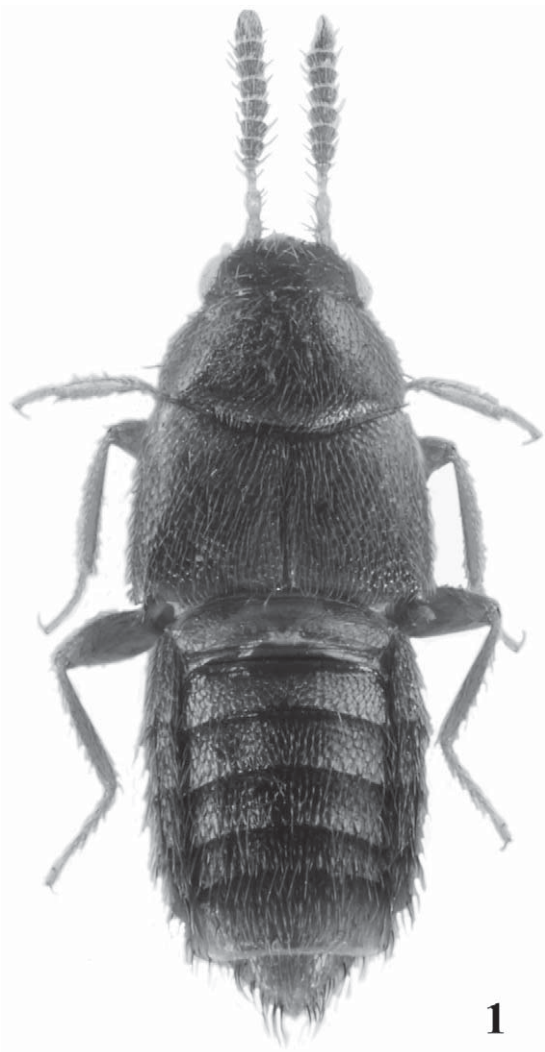
Fig. 1. Habitus of Agaricomorpha ashei sp. nov. 1.6 mm.

3) with distinct median tooth, prostheca well developed, divided into two distinct areas, condylar molar patch narrow, composed of toothlike structures; maxillary palpomeres (Fig. 4) 2–3 dilated distally, 4 with a small spine at apex; labium (Fig. 5) with ligula protruded, parallel-sided, divided in apical three-fourths, almost as long as labial palpomere 1, labial palpus with two palpomeres,