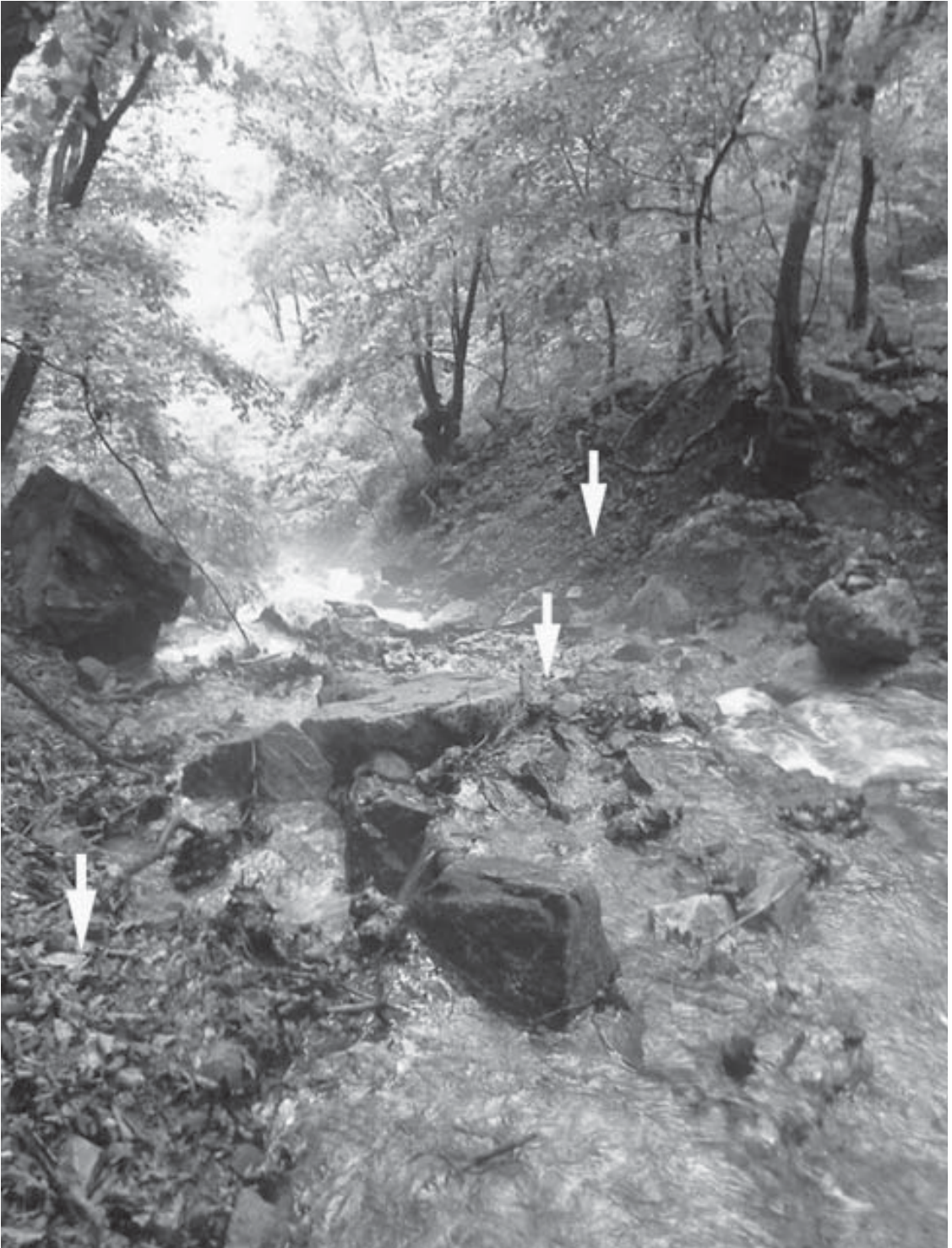
Fig. 15. The type locality of Aloconota elongata sp. nov. , mountain stream at Mt. Jirisan, Gurye-gun, Korea. This species were found under stones and flood debris near stream of this photograph.