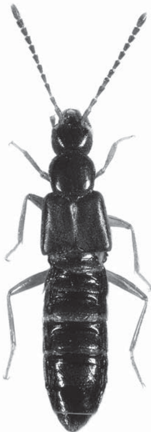
Fig. 1. Habitus of Aloconota elongata sp. nov. , 4.1 mm.

Length 4.0-4.5 mm. Body large, parallel-sided; surface glossy, densely pubescent with microsculpture (Fig. 1). Body usually dark brown to black; basal antennomeres, mouthparts and legs paler brown; head and abdomen slightly darker than pronotum and elytra. Head . Slightly elongate, approximately 1.1 times longer than wide, slightly narrower than pronotum; eyes slightly prominent, about 1.4-1.5 times as long as tempora; gular sutures moderately separated, dilated basally; infraorbital carina incomplete; cervical carina forked. Antennae (Fig. 7) long and