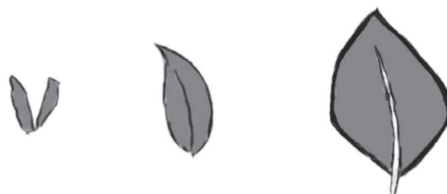
Fig. 1. Sketches of citrus leaves at several maturity stages.

For the purposes of this study 4 key EPG variables were measured and analyzed (i.e., duration of pathway phase, C; duration of xylem