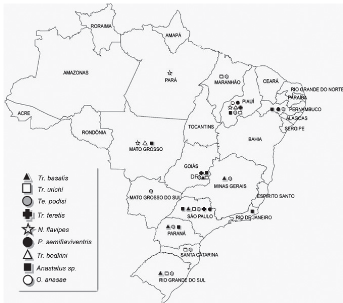
Fig. 2. Map of the known occurrence of the stink bug parasitoids Trissolcus basalis , Tr. urichi , Tr. teretis , Tr. bodkini , Telenomus podisi , Phanuropsis semiflaviventris , Neorileya flavipes , Ooencyrtus anasae , and Anastatus sp. in Brazil.