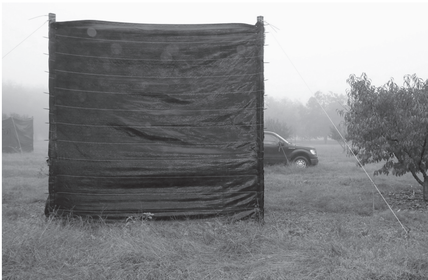
Fig. 1. A 3.7 \times 3.7 \times 3.7 m fence was erected around a peach tree to determine if this physical barrier would reduce adult Euschistus servus from reaching a pheromone-baited trap placed inside the enclosure near the tree.