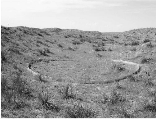
FIG. 2.—Placement of the west experimental arena (looking NNW) in a depression in the upland sandhills northwest of Gimlet Lake.

demographic studies of turtles (e.g., Converse et al., 2005; Iverson, 1991). Mud turtles to be displaced to arenas for our experiments were captured in the spring along the middle of these fences as they migrated directly to the wetland from their winter hibernation sites in the adjacent sandhills. When captured at the East Fence, turtles to be displaced had already traversed at least 60 m on their migration path to the lake (ca. SSW = 202.5^\circ ); those at the West Fence had moved at least 20 m (ca. ESE = 112.5^\circ ).