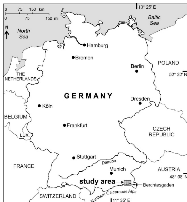
FIGURE 1. Germany and the location of the study area (Maps of Germany, Munich 2007).

Triassic white Dachstein limestone ( \text{CaCO}_3 + \text{MgCO}_3 \geq 93\% ) is widespread, while remnants of Cretaceous (Lower and Middle Gosau) sediments cover only small areas due to erosion after tectonic uplift. Frost-weathered talus deposits and the debris of rock fans cover the surrounding steep slopes, and exposed beds of limestone comprise the syncline of the central karst plateau. A Pleistocene history of glaciation is documented by a polished glacio-karst relief and scattered local moraines.