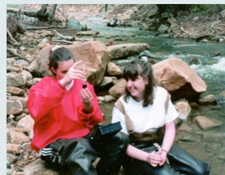
FIGURE 4 Members of a water-quality monitoring team testing Mill Run, Allegany County, Maryland.