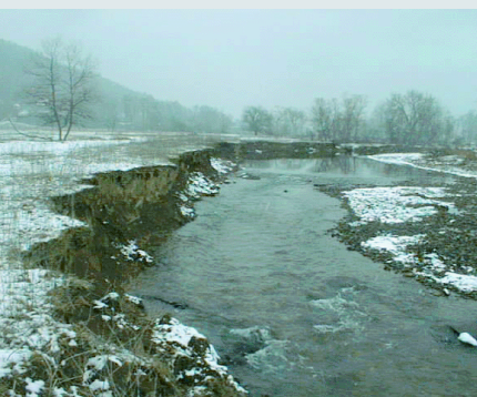
FIGURE 5 Bank erosion along Knapps Creek.