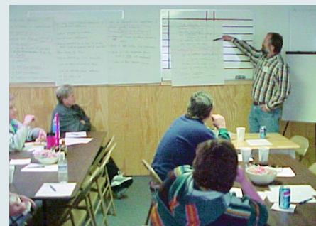
FIGURE 3 The author facilitating a strategic planning exercise for the Lower Paint Creek Association, West Virginia.

There is also a need for an infrastructure of support that provides grants, training, resource brokering, facilitation, and coordination among watershed entities. Such an infrastructure has arisen in West Virginia, helping to ensure the long-term sustainability of the region’s watershed associations through processes that operate by inclusiveness and consensus. The priority now is to apply these lessons throughout the mid-Atlantic highlands of Central Appalachia.