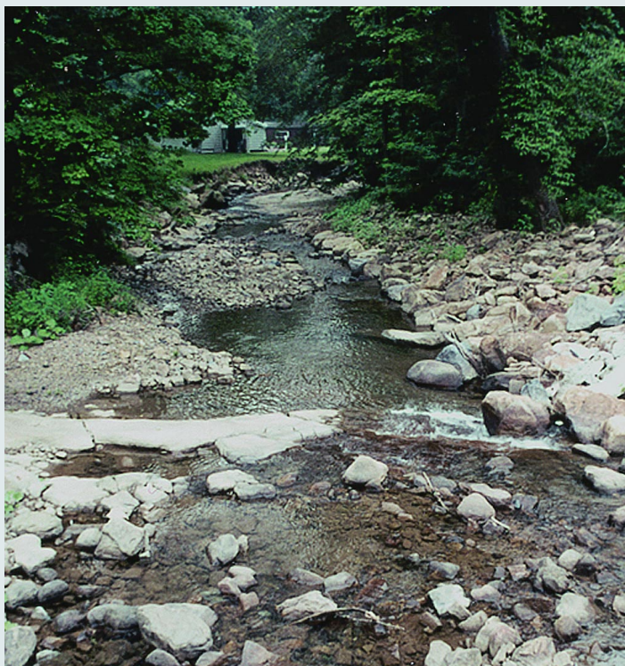
FIGURE 1 Recovering second-growth deciduous forest along Paint Creek, Kanawha County, West Virginia.

In 1993, the executive branch of West Virginia's state government established the Watershed Conservation and Management Program. The Program's Planning Team relied on voluntary stakeholders from agriculture, business, conservation, forestry, government, mining, and other interest sectors to provide much of the plan's content. In 1994, the agencies published "A Strategic Plan for West Virginia's Watersheds," which included ideas from 89 statewide stakeholder groups. The Planning Team achieved consensus through repeated listening sessions rather than open debate and voting by stakeholders. The plan's strategies emphasize voluntary compliance, economic incentives, and public education. At several intervals in the process, consensus was measured; the plan was finalized when consensus reached 84%.