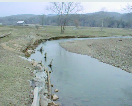
FIGURE 6 Channelizing in the Knapps Creek watershed has been an unsuccessful conventional approach to combating bank erosion.