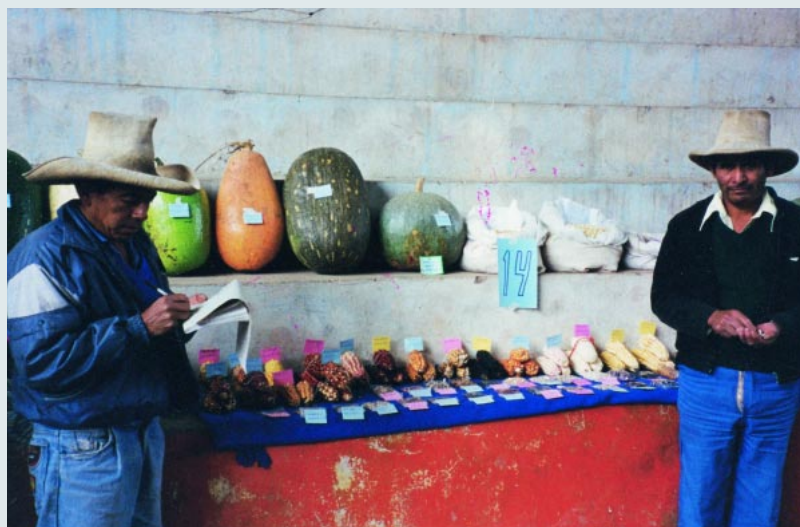
FIGURE 4 Native crop varieties are evaluated at a local contest in Huancayo, Peru.

As the process of on-farm conservation is inherently dynamic, maintenance of traditional native varieties requires periodic monitoring. The conservationist campesino association receives advice on and support for both technical and financial monitoring based on the results of the thematic