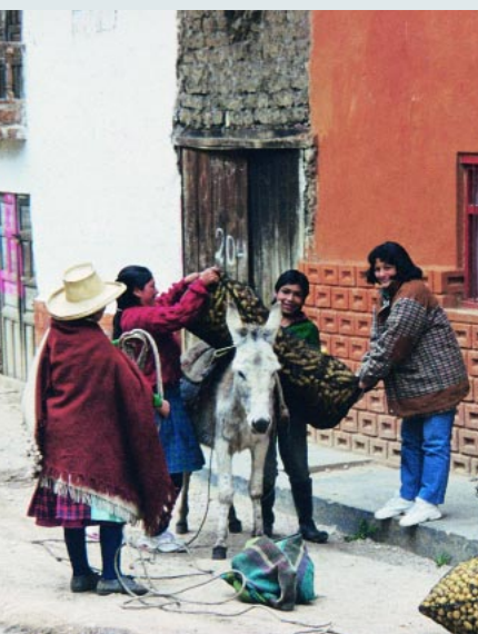
FIGURE 6 Campesinas preparing to market native varieties of olluco in La Encañada, Cajamarca.

dates, it can be expected to assume more formal responsibilities related to conservation. In addition, it must be regarded as a pilot project to promote biodiversity on an economically sustainable basis by marketing native varieties through agroindustrial companies (purchase of native varieties of potato, tubers, grains, medicinal plants, etc; Figure 6). The ultimate aim of the model is integrated rural development (Figure 7).