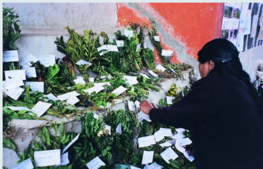
FIGURE 3 Campesina at a seed fair in Cajamarca, Peru, exhibiting medicinal plants used locally.

Plant genetic resources cannot be conserved if environmental conditions are not maintained at a level adequate for their regeneration. From this perspective, rehabilitation and conservation of soil and water resources are basic requirements for creating a prosperous environment on plots where in situ conservation of agricultural diversity is planned.