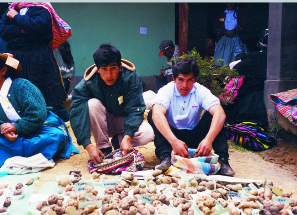
FIGURE 1 Potato varieties displayed at a seed fair in Huancayo, Peru.

result of several years of experience in rural development projects. This model includes so-called seed fairs (Figure 1) and encourages the creation of local seed banks managed by a conservationist campesino association. The HimalAndes Project, which promotes technical cooperation to support exchange of seeds and local knowledge between mountain agriculture ecosystems, is another recent project with a partial focus on agrobiodiversity conservation in Andean and other countries.