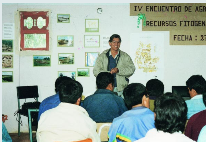
FIGURE 5 Conservationist campesinos at a thematic workshop on genetic resources in Cajamarca, Peru.

So far, the Cajamarca model has proven to be a suitable way of encouraging genetic conservation activities in the context of local rural development strategies. However, at a national level, different needed actions are still missing. For example, official recognition by the Ministry of Agriculture and PRONAMACHS (National Soil Conservation Program) would provide conservationist campesinos with an identification card and recognize them as members of a national association. On the other hand, as the association consoli-