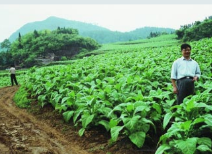
FIGURE 4 Tobacco is a major cash crop in Dejiang County, Guizhou Province.

Increased yields and the development of food processing plants as well as an increase in disaster-free farmland (from 0.2 ha per capita in 1989 to 0.34 ha in 1996) permitted major progress in the struggle against poverty. Infrastructure has also improved significantly: over 90% of towns and villages now have access to electricity, telephone services, and roads. But poverty has not been eradicated, and many new demands and problems have arisen in the past 10 years. Raising the standard of living has become an important new objective, but it is questionable whether the path taken in other parts of China to reach this goal is the right one for this mountain region.