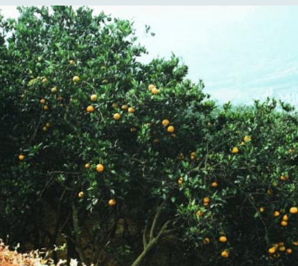
FIGURE 7 Orange plantation near Jishou in the Tujia Nationality's Prefecture in Hunan Province. Focusing exclusively on oranges in the area has led to overproduction and a waste of resources. Market analysis is needed to adapt to new economic conditions.

Group and the Xiangquan Group, whose businesses involve not only food but also other products such as medicine.