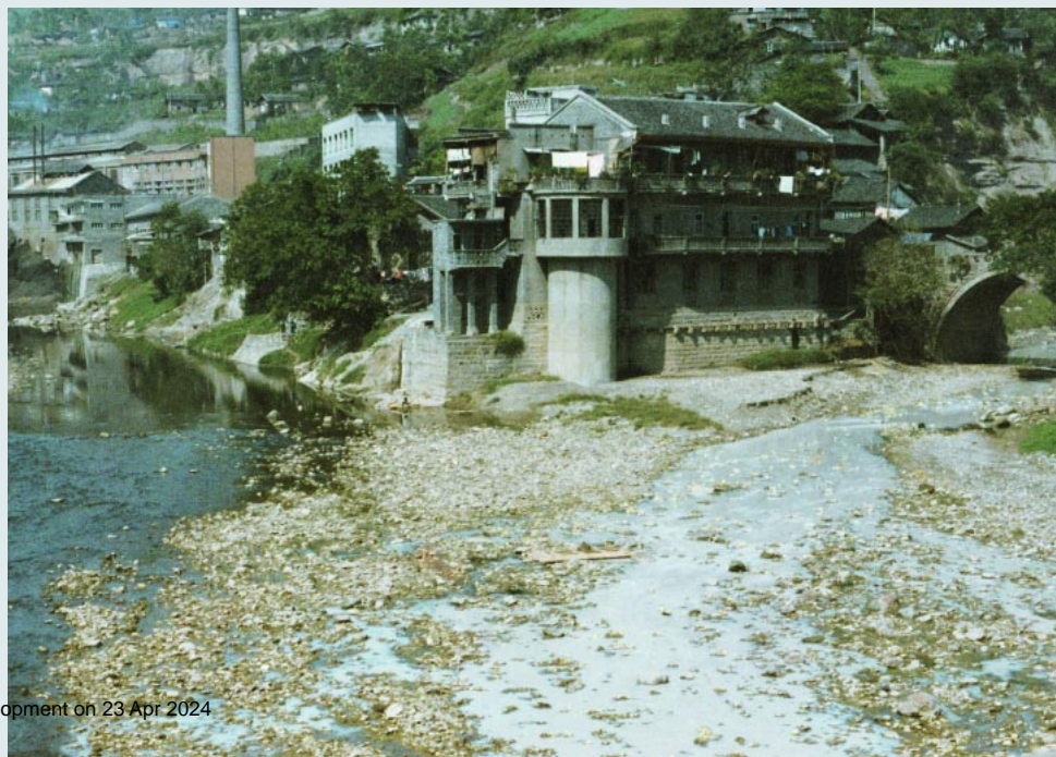
FIGURE 6 Polluted river in Wanzhou District, Chongqing Municipality.

Backbone industries must be defined according to new principles: the focus should be transferred from previous departments of industry and trade to industrial groups and products that are profitable and competitive. For example, making the food industry a backbone of the economy should no longer be a goal. Support should be given to internationally competitive enterprises such as the Maotai