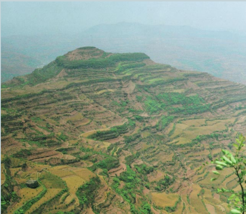
FIGURE 1 Yingyang County in Chongqing Municipality: cultivation on steep hills causes erosion.

There is also a need to raise awareness of the requirements for sustainable development strategies in mountain areas. This will involve industrialization of agriculture, increasing the quality of products in the primary and secondary sectors, developing the service sector, improving infrastructure for transport and trade, and letting the market determine resource use rather than vice versa. The following introduction to the region and its problems is complemented by recommendations for enhancement of economic strategies in the mountain areas shared by Chongqing Municipality and the provinces of Hubei, Hunan, and Guizhou and linked by the Yangtze and its tributaries.