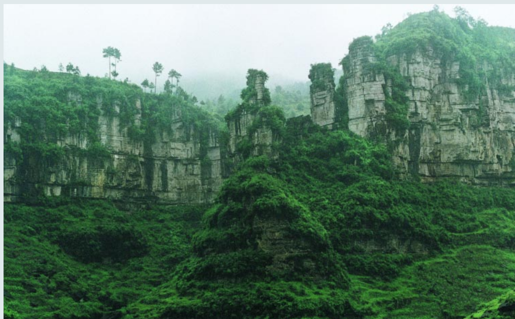
FIGURE 9 Jinfoshan (the Gold Buddha Mountain) in Nanchuan County, Chongqing Municipality, is a spectacular tourist attraction.

ucts. Further development will depend on market expansion.