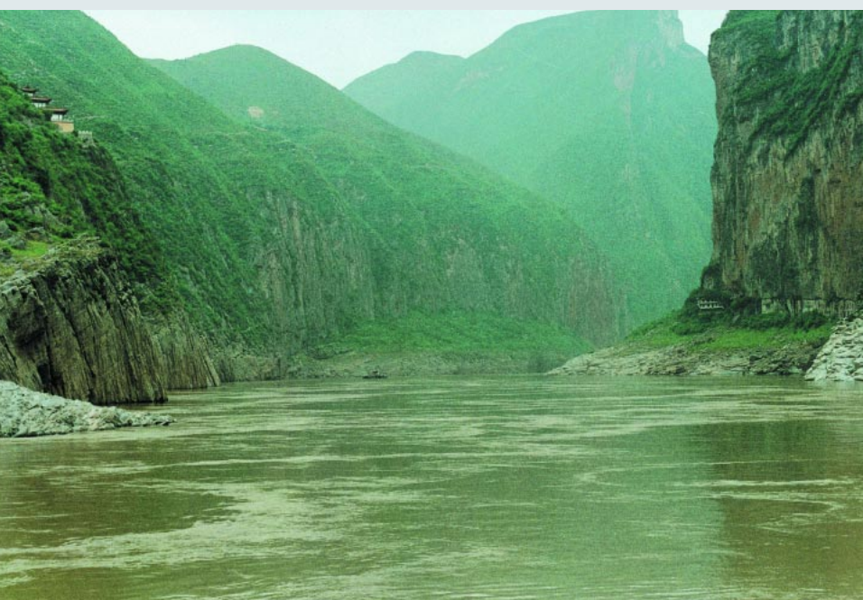
FIGURE 3 The famous Three Gorges of the Yangtze River are a well-known tourist attraction.

domestic product (GDP) in 1998 was only 1.53% of the overall Chinese GDP.