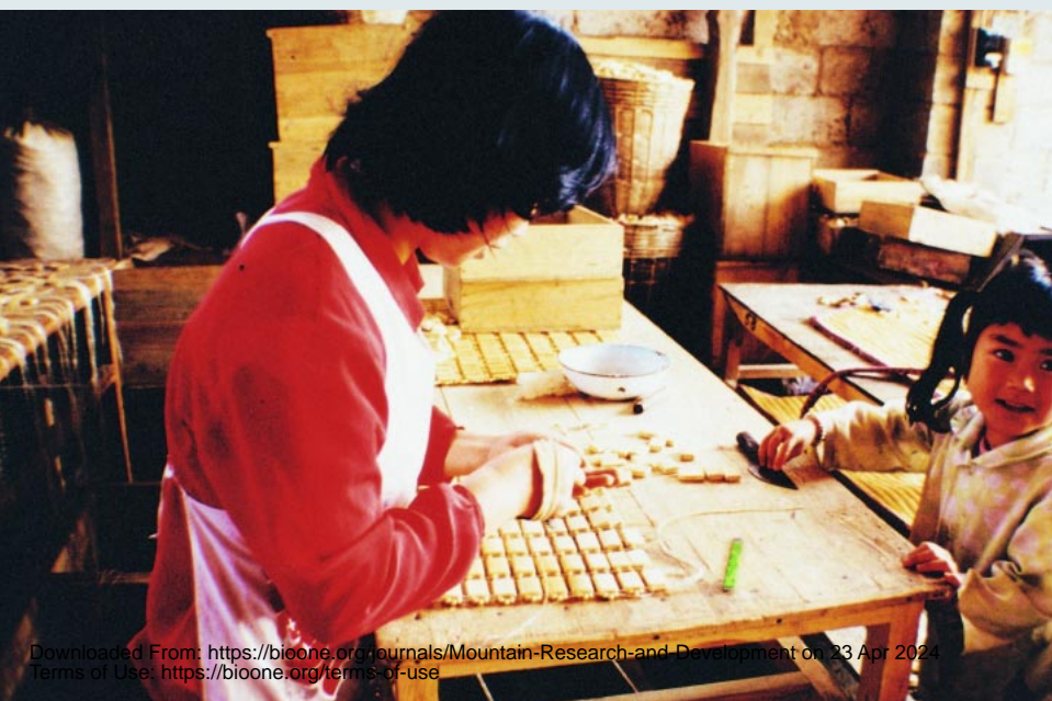
FIGURE 8 Local arts and crafts could become the source of new income in the tourist sector. Production of bamboo articles in Yanhe County, Guizhou Province.

The industrial sector should focus on enhanced management of advantageous products. The machinery industry should be given priority, with a focus on automobiles, tractors, motorcycles and motorcycle parts, engines, and inland river ships. The food industry, high-performance cement for building dikes and roads, and decorating and ceramic materials are also important. Paper slurry could be developed using local raw materials. Industrial development must focus on variety, high quality, and mass production as well as on the market.