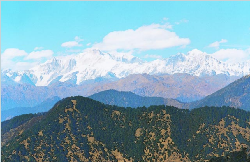
FIGURE 1 Snow-clad mountains with extensive alpine grazing lands constitute the core zone of the Nanda Devi Biosphere Reserve.

economic benefits. The present case study focuses on the issue of crop and livestock depredation by wildlife as a major source of conflict. Feasible solutions in the given socioeconomic context are outlined here; some of these are being tested by the authors in the study area. The results are expected to provide more sustainable livelihood measures and stimulate greater participation in conservation programs.