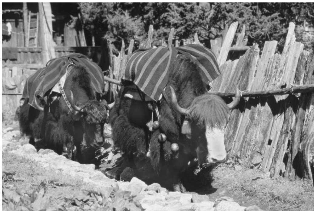
FIGURE 3 Yaks transporting potatoes to the winter settlement at Phale. (Photo by U. Müller-Böker, September 1998)

(non-user-group members) have to pay fees. A healthy population of blue sheep above Khānpāchen (Brown 1994) indicates that the local management of pastures is not only sustainable, but also supports wildlife. Since the refugee residents of Phale do not have pastures or pasture rights, they have a system of coherding with the residents of Ghunsā. In exchange for half the production ( ghiu, churpi ), Ghunsā herders take Phale livestock to their summer pastures. The livestock is kept near Phale in winter. Another group using Ghunsā's pastures are Chetri shepherds from the Taplejuñ area, who practice extended transhumant migration.