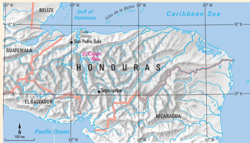
FIGURE 2 Map of Honduras, showing the location of El Cajon Reservoir and the city of San Pedro Sula at the edge of an extensive lowland area. (Map by Andreas Brodbeck)

Fortunately, total rainfall during Mitch was less extensive in the central part of Honduras where the El Cajon watershed (Figure 3) is located. Total precipitation was between 400 and 600 mm, compared with approximately 1000 mm in the north and as much as 1600 mm in the south. Nevertheless, these 400–600 mm constituted an extraordinary event for the El Cajon area, representing about half its total annual rainfall. The year 1998 had been a dry year before Mitch struck in October. This was the reason why the