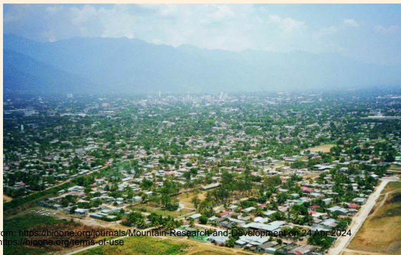
FIGURE 4 View of the Sula Valley 1½ years after Hurricane Mitch, showing the city of San Pedro Sula in the background. The densely settled valley was directly in the path of the discharge that flowed down the Comayagua River in the wake of the hurricane.

While detailed official calculations have not yet been made, it can be stated that El Cajon had two main impacts on the floods caused by Hurricane Mitch: a delay of discharge and a very substantial reduction of peak discharge. If the 600 million m 3 of water retained by the reservoir had gone downstream in addition to what flowed down the valley and if peak discharges had not been greatly reduced, the flood would have inflicted much more serious damage than what was observed, especially in the densely populated Sula Valley. However, the mitigating role of El Cajon was enhanced by the exceptionally low dam filling level in October 1998. With normal water levels, maximum discharge and discharge volumes would have been greater. The possibility that the central part of Honduras, and hence the El Cajon watershed, will be struck again by strong hurricanes in the future cannot be ruled out, especially in light of climate change, which could increase hurricane frequency in this part of the country. Considering this possibility, what are the options for reducing the risk of downstream destruction? The following is a short overview of these options and the role the dam could play in helping prevent disasters in the future.