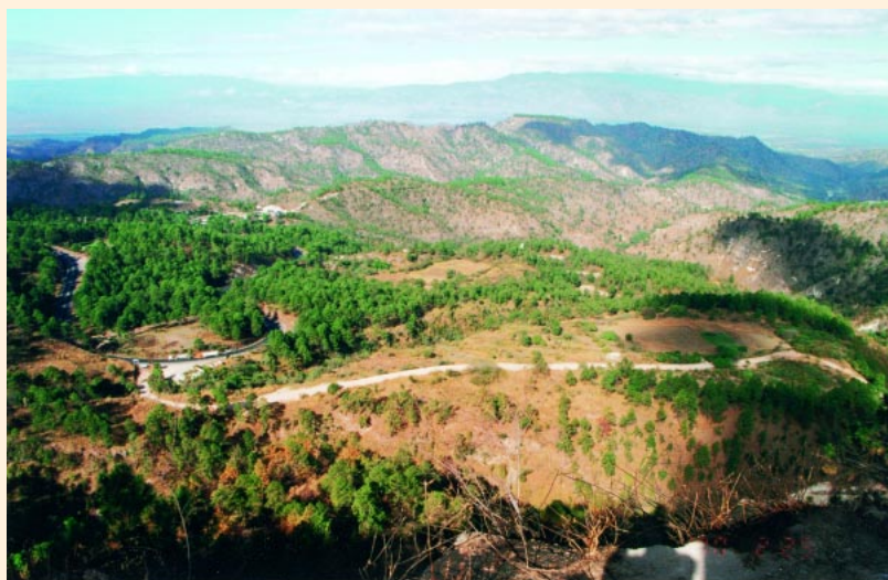
FIGURE 3 View of the El Cajon watershed, which is dominated by pine forests.

true for the input volume, which was three times higher than the value calculated with the dates for Fifi but still well below the maximum tolerable value.