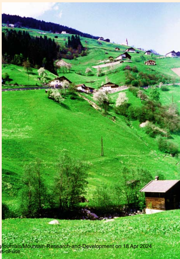
FIGURE 4 Farming still shapes Alpine landscapes but depends on on-going support to fulfill its wide-ranging tasks.

The encouraging results of pilot programs significantly influenced the assessment of mountain development and the scope of economic activities perceived as opportunities in these areas. The Austrian experience shows that successful policies to safeguard environmental amenities and cultural landscapes while promoting regional development calls for the incorporation of spatially oriented sectoral policies in integrated regional development