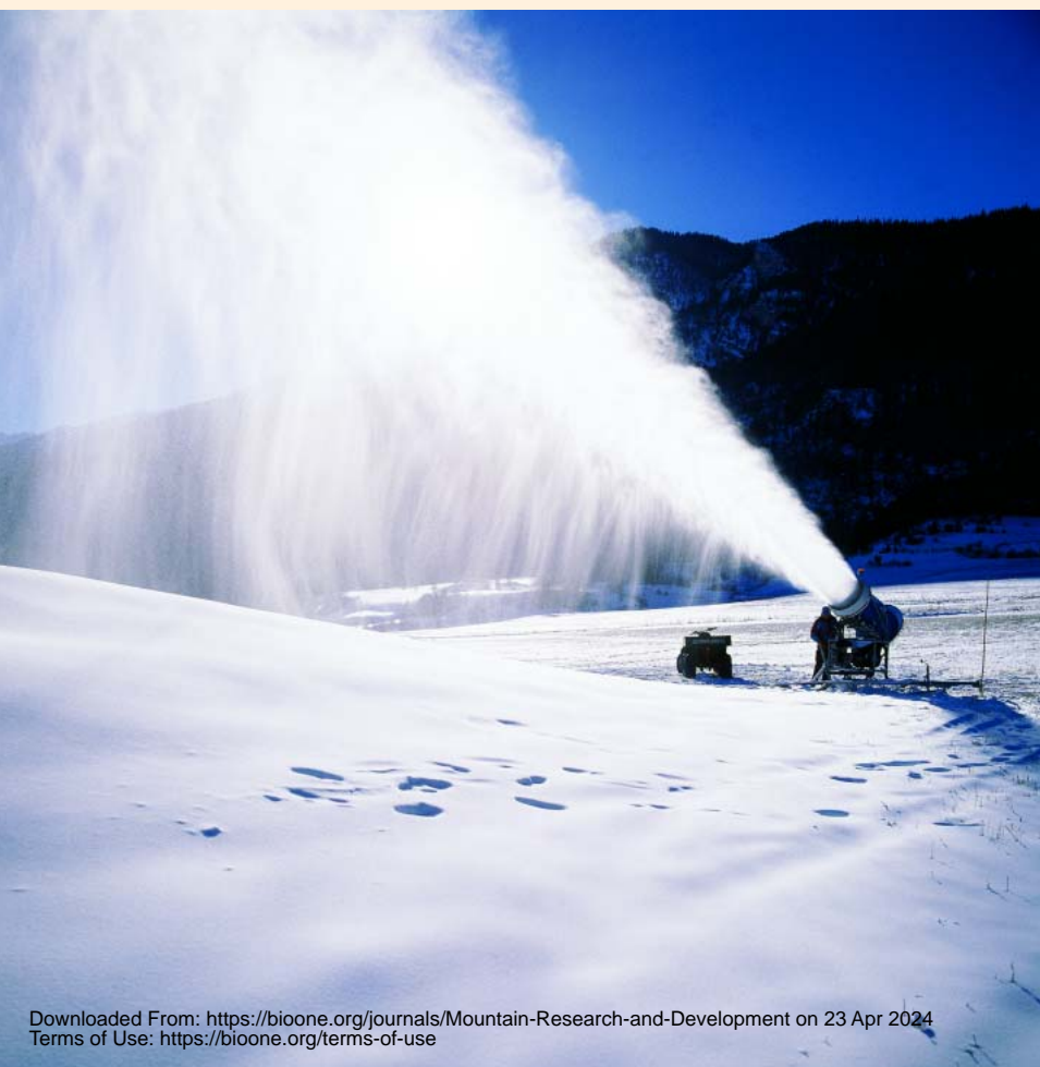
FIGURE 4 Snow cannon: such devices are expensive and can only be used under very specific climatic conditions.

At present, adaptation strategies prevail. One of the best known measures for reacting to uncertain snow cover levels and snow scarcity is the installation of artificial snow blowers. When it comes to future improvement of mountain transport facilities in winter, modernization of the facilities and extension of artificial snow installations are a top priority. Estimates for the year 2003 predict that artificial snow runs will account for 7.7%, or 1700 ha, of ski runs, totaling 680 km. This is not much by international comparison, however. Artificial snow installations are cost-intensive: Investment costs per km for artificial ski runs are about US$0.6 million, and annual operating costs are between US$19,000 and 31,000/km. Moreover, artificial snow production is limited; it is impossible if temperatures are too high. Accessing higher areas for ski tourism may guarantee more snow, but it is linked with a series of problems. This strategy calls for high-level technical investments and is thus cost-intensive due, for example, to permafrost. It entails an expansion of ski tourism into ecologically