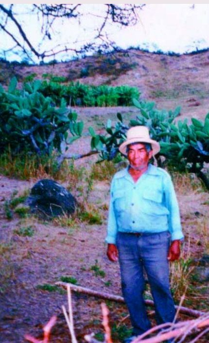
FIGURE 3 A farmer on his land, showing the Opuntia burrows technology, which is perfectly adapted to dry conditions and improves the productivity of traditional crops such as the maize visible in the background.

tia together with other crops. The technology diffused by the project seems well adapted to existing environmental conditions and has proven to be a good ecological alternative in strengthening agro-ecological practices. In the last phases of the project, as part of its strategy of replicability, economic value was assigned to native species and an “agro-ecological model” adopted as the starting point for environmental sustainability.