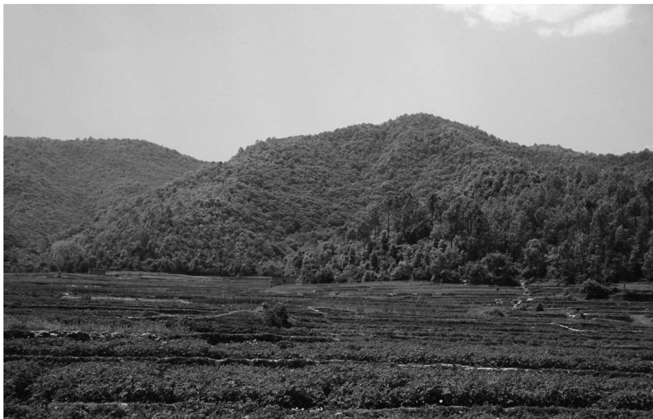
FIGURE 3 Land use and conversion to high forest in Roshi Watershed at 1500 m. The 3 main pathways of high forest regeneration are visible on this hillside. On the right toeslope is a successful P. roxburghii plantation, with a minor component of broadleaf regeneration. On the central slope (rear) is mixed broadleaf successional forest arising on formerly degraded land. On the left toeslope is mixed broadleaf forest that regenerated within a P. roxburghii plantation and is now dominant on that site.

program in Roshi is succeeding at improving forest cover and condition. Field observations made by one of the authors (A.P.G.) during January–February 1999 found that local residents were skilled at explaining how degraded forests converted to high forests within a few years of protection. At some locations, residents noted a recent increase in livestock loss because of leopard predation. This change was attributed to improved leopard habitat (ie, forest recovery). Other communities in Roshi noted a recent increase in the availability of some of the forest products, including fuelwood (Gautam 1999). In the same study, local key informants expressed improvements in the “overall environmental condition” during the last 10 years, despite a decrease in agricultural productivity (Gautam 1999). The improvement in overall environmental condition was attributed to improvements in forest condition. The perceptions of local forest users provide another avenue of support for the positive biological impacts of implementing Nepal’s community forestry program.