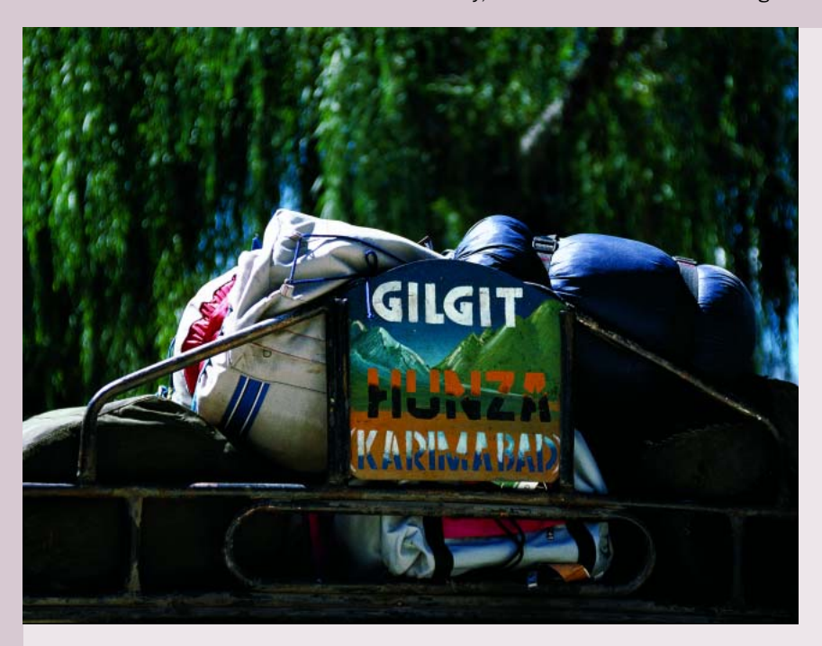
FIGURE 1 International tourists who visit the north of Pakistan no longer use local buses such as this one. (Photo by Andreas Rüfenacht, 1989)

ment, and ecotourism are closely linked. Tourism activities in Pakistan are currently far from sustainable, as in many other mountain regions worldwide: deforestation, uncontrolled land utilization, unplanned growth of tourism, mushrooming growth of accommodations, and, above all, outmigration of young, energetic people as a result of limited job opportunities and lack of local ownership and participation in tourism ventures make change imperative. This paper recommends strategies and measures that urgently need to be developed at all levels.