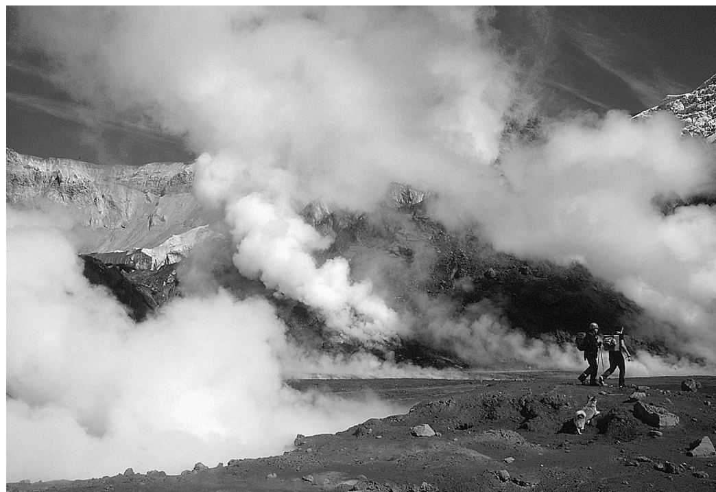
FIGURE 1 The active volcanic Mt Mutnovsky area in Kamchatka attracts scientists and ecotourists.

Current ecotourism development centers on more than the magnificent landscape and natural resources. As early as 1990, even before Kamchatka was officially opened to foreign visitors, small groups interested in indigenous cultures traveled to Esso, a center for