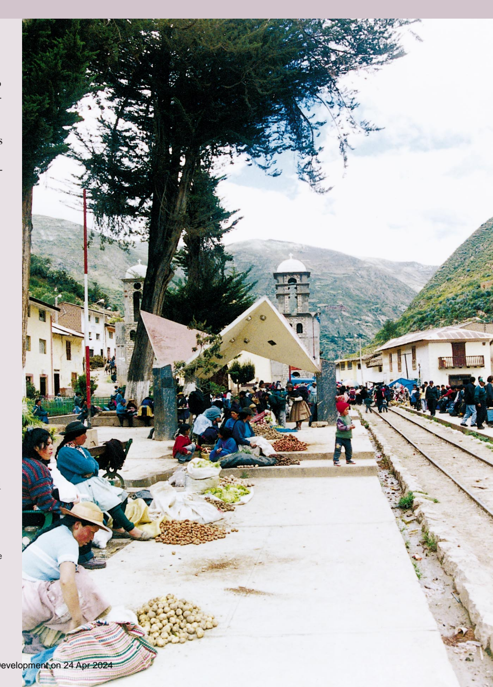
FIGURE 1 Access to markets and mobility are made possible for isolated communities in rural areas by infrastructure such as this railway line in Izcuchaca, Peru.

Downloaded From: https://bioone.org/journals/Mountain-Research-and-Development on 24 Apr 2024 Terms of Use: https://bioone.org/terms-of-use