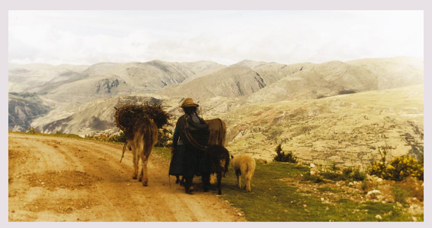
FIGURE 2 A local woman uses a rehabilitated rural road to do household work in Huancavelica.