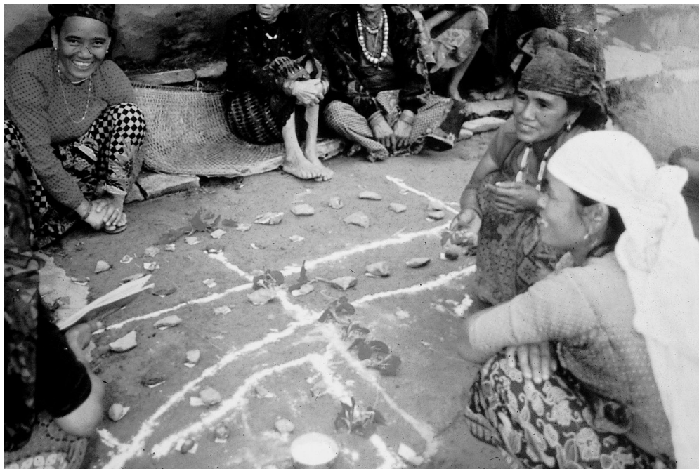
FIGURE 2 Women's knowledge of seed varieties, cultivation, storage, and use is a valuable form of human capital often ignored by policy and decision makers. Here, women construct a "seasonal calendar."

The Kirats, who are one of the oldest ethnic groups in the region, until recently practiced a distinct system of communal land tenure known as kipat . In the decades following a "unification" drive in the mid-18th century to unite Nepal under its present system of monarchs, the Kirats were confronted with numerous challenges to their traditional way of life. The influence of the dominant lowland Hindu groups, combined with the self-interested activities of local headmen or tax collectors ( jimmawal N), led to fundamental transformations of sociocultural practices and land management systems. Extensive areas of forest where traditional swidden practices once dominated were replaced with the ubiquitous rain-fed ( bari N) and irrigated terraces ( khet N) suitable for wetland paddy crops (Sagant 1996; Gurung 1997). Perhaps the most significant outcome of the unification drive was the gradual out-migration of Kirats eastward to Sikkim and beyond because lowland Hindus were actively encouraged to migrate to upland kipat areas (Regmi 1965; Caplan 1970; McDougal 1979). This historical precedent anticipated the increasing trend in out-migration today, with men now seeking employment in urban