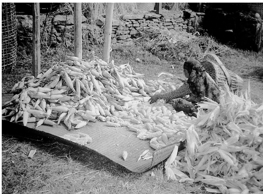
FIGURE 3 Gendered activities such as selecting seeds for consumption or the next year's planting are a vital postharvest task that ensures adequate nutrition in mountain communities.

postharvest activities that includes grain storage, food processing, and food preparation. As grains or other crops come in from the fields, women decide what will be stored, processed, and saved for next year's crops (Figure 3). In making these decisions, women concentrate on providing adequate and nutritious food for their families throughout the year. They must consider factors such as taste and the texture of the food, depending on the meals that will be prepared and whether the food will be fed to children, adults, older people, or particular animals. These decisions are based on considerations that take account of the multiple uses of crops (Sachs 1996, 1997).