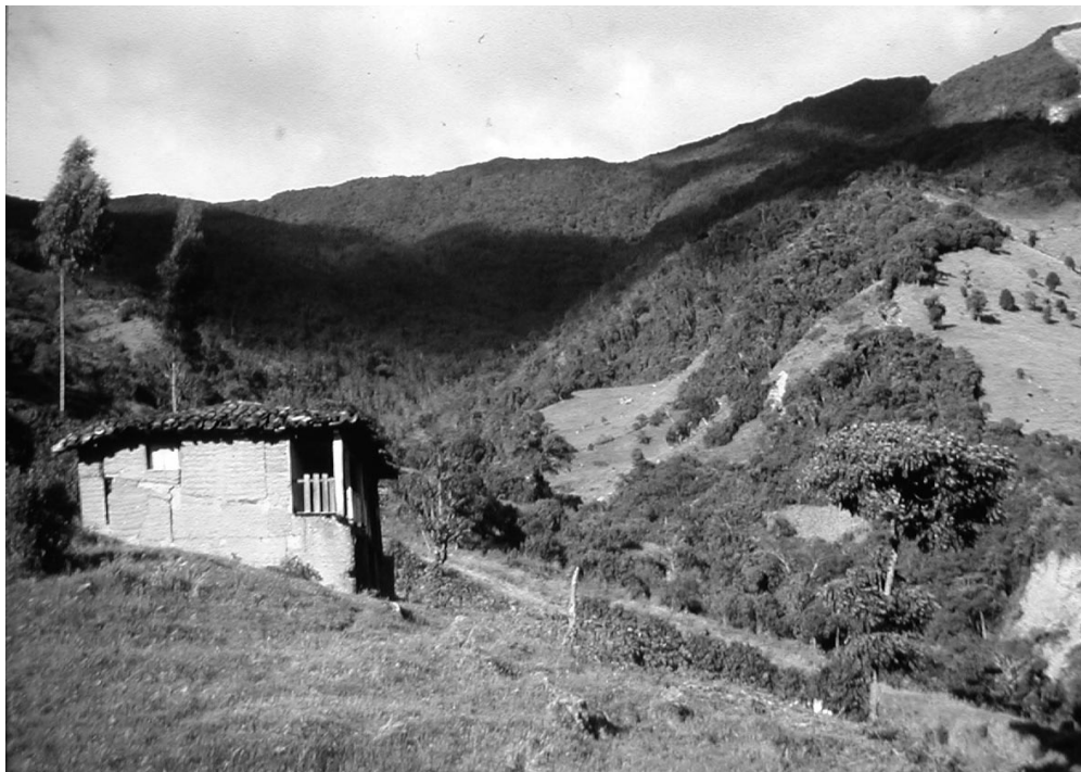
FIGURE 2 A view of the rural landscape of Carchi province, where human activity encroaches on the TMCs and expands the agricultural frontier, thus raising the lower limit of the tree line. Past activity has been more important in forming the páramo and the upper tree line. Past and current pressures make protection of cloud forest remnants crucial in this area.

forests still survive in isolation above 3800 m (Sarmiento 1988) around Chique Lake. The climate pattern, typical of the tropics, is characterized by generally uniform temperatures the year round (mean temperature 12°C) and 2 distinctive moisture regimes—a rainy season with mean precipitation of 2700 mm/year and a dry season with mean precipitation of 520 mm/year (Cañadas-Cruz 1983). Isolated “islands” of páramo display typical grass-