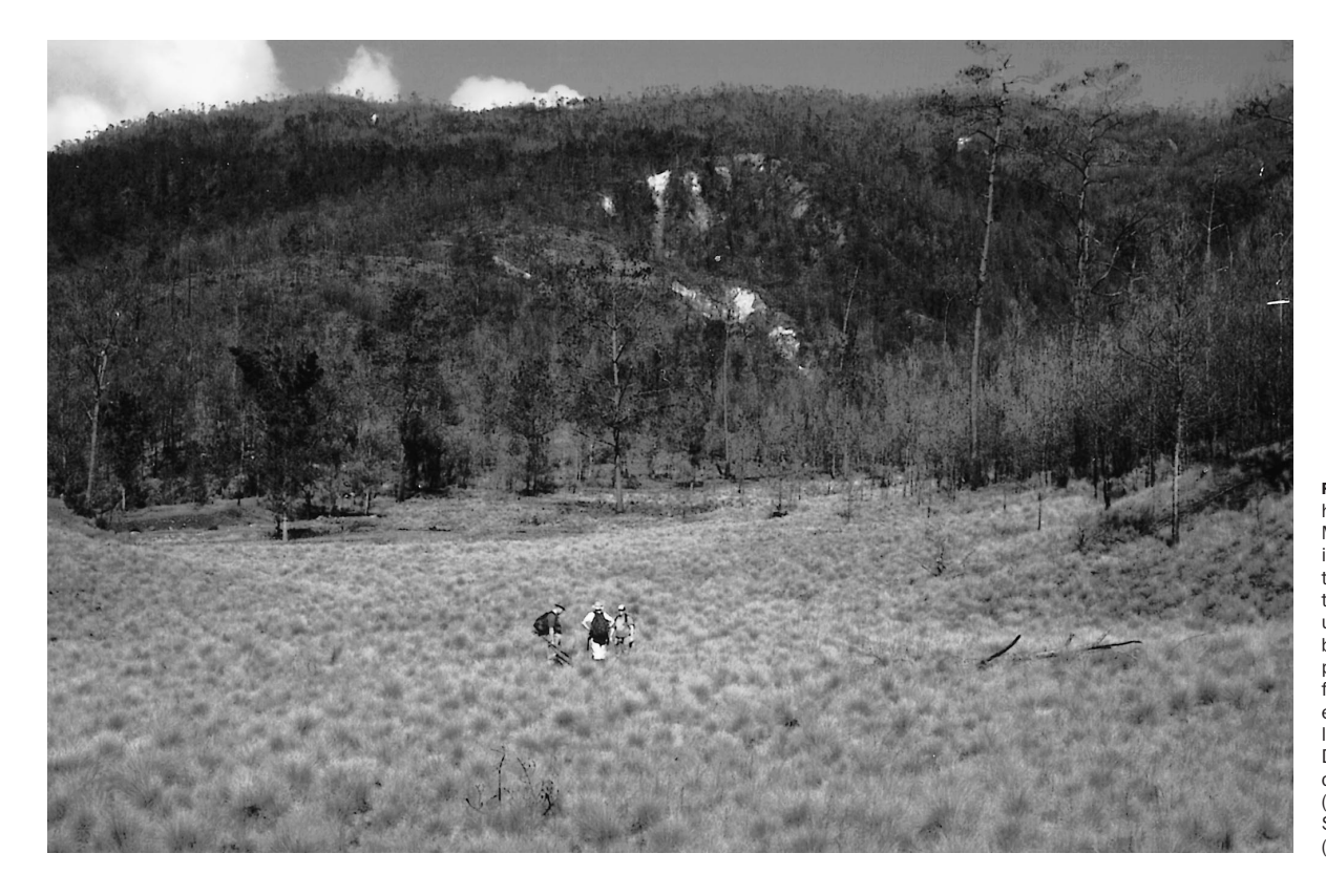
FIGURE 2 Approximate lower half of length of Sabana Macutico, January 1999. View is down gradient toward termination of savanna at its truncation by the channel of upper Río Macutico (in trees, at base of near ridge, photographic center). Small fanlike features can be seen entering the savanna on the left and right sides of the view. Debris slide scars on ridges date from Hurricane Georges (22 September 1998–23 September 1998, Class IV).