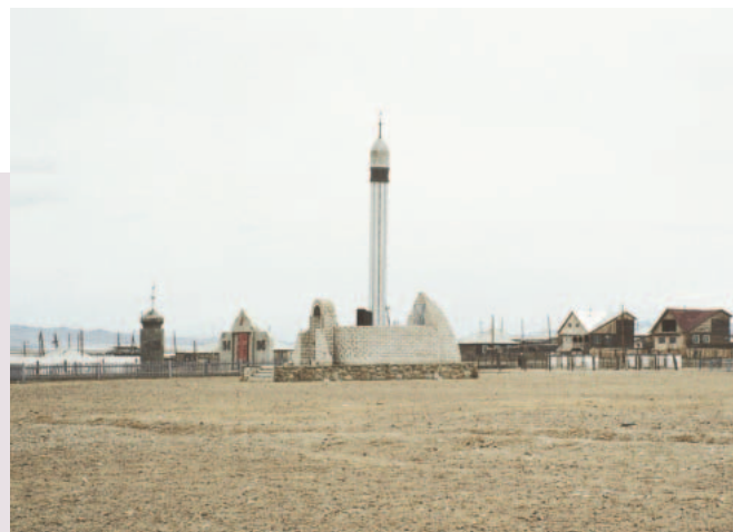
FIGURES 2 AND 3 Ancient Telengit (left) and modern Kazakh (right) religious sites in the Altai Republic.

under rather severe natural conditions: mountainous relief (2000–2500 m; the highest peak, Belukha, is 4506 m), severe winters (temperatures as low as -50^{\circ}\text{C} ), permafrost, and a short vegetation period. This is a classic example of survival under extreme mountain conditions. Isolation and dependency on economic and cultural centers located in areas with more favorable natural conditions give rise to acute social and economic problems. Even during the relatively favorable Soviet period of development (from the 1960s through the 1990s), when the state provided stable economic subsidies and social assistance in mountain regions, the basic standard of living remained relatively low. It should be emphasized that state subsidies accounted for nearly 100% of local budgets. This state policy, evenly applied to the entire population of the region, made it possible to preserve social stability, ensured by harsh administrative methods (through the system of Soviet-style collective farms).