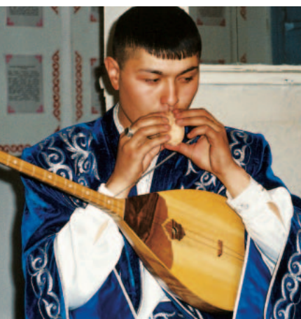
FIGURES 4 AND 5 Art brings people closer together: Telengit (above) and Kazakh (below) musicians play folk tunes.

through a shaman), the Telengits are not active in trade or entrepreneurship, hoping to get support from outside (through state and international funds). This may be why the idea that the international community should provide moral and financial support for the culture and the natural environment of the Altai is so popular among the Altai population.