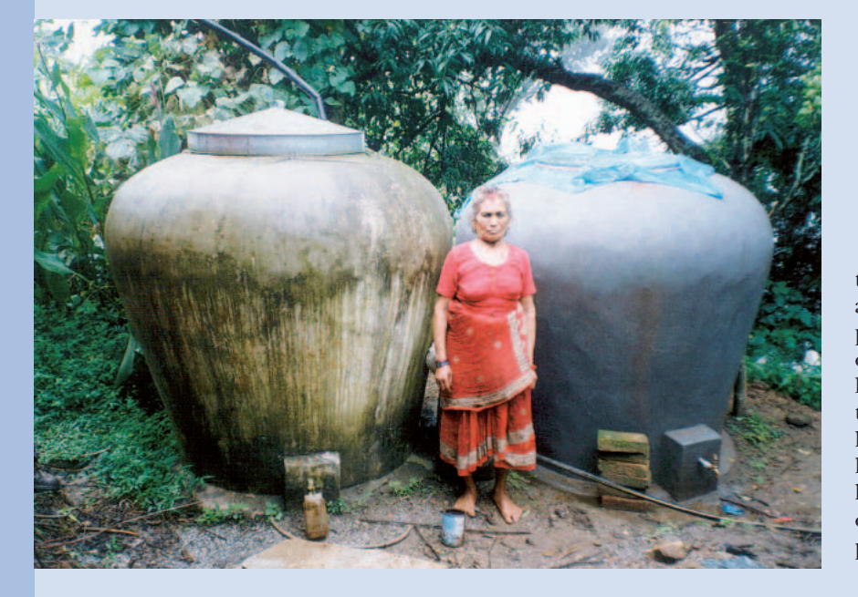
FIGURE 1 A local woman with a project-financed water harvesting jar and a jar financed completely by her family.

and the Yarsha Khola (YKW)—by the People and Resource Dynamics in Mountain Watersheds of the Hindu Kush–Himalayas Project (PARDYP), operated by the International Centre for Integrated Mountain Development (ICIMOD), revealed that: