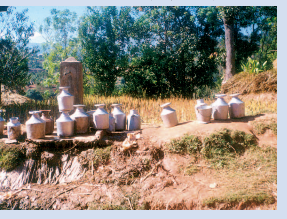
FIGURE 3 Water vessels (gagri) in front of a tap, to be filled.

Middle Mountains but could help to increase water supply, mainly along the ridges in the watersheds and on spurs with no access to springs or streams. PARDYP, in collaboration with the Water Harvesting Project of ICIMOD and RWSSSP, provided hands-on training to local masons in JKW and YKW in the construction of lowcost roof water collection systems. In addition, 13 units were fabricated for demonstration purposes, and another 6 systems were installed at local initiative. According to a study by PARDYP, the main beneficiaries of this technology are women and children because they are largely responsible for collecting water for household use and for animals (Figure 3).