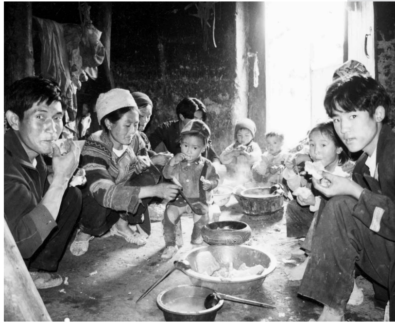
FIGURE 5 A Yi ethnic minority family in the upstream area of the Ezhang River.

Given environmental deterioration in Liangshan Prefecture, particularly in Qionghai Lake in the early 1990s, the Prefecture Environmental Protection Office, set up in 1977, was elevated to full bureau status in 1997, with 2 environmental monitoring stations given prefecture-wide responsibility. Xichang's Environmental Protection Office was established as an independent bureau within the city government. Establishment of the Qionghai Lake Management Bureau (QLMB) was accompanied by successive rounds of legislative action by the Liangshan Autonomous Prefecture People's Representative Congress, culminating in the issuing of the Qionghai Lake Protection Regulations in 1997. According to these regulations, the Xichang City Government and the governments of Xide County and Zhaojue