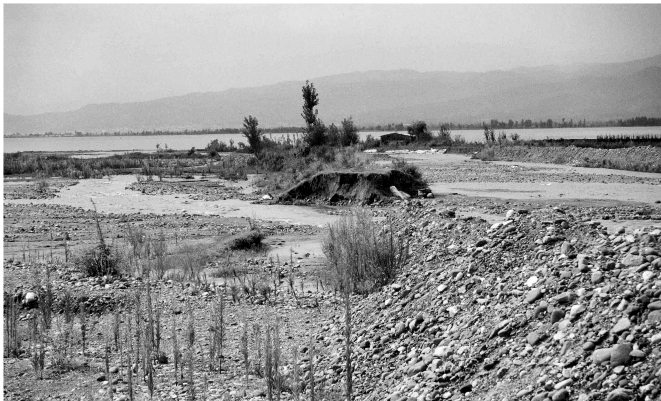
FIGURE 4 The bank at the mouth of Ezhang River was destroyed by debris flows; such sources of sediment have been responsible for shrinkage in the surface area of Qionghai Lake.

It is difficult for an aquatic ecosystem to be restored to health once it becomes degraded (Nakamura 1997).