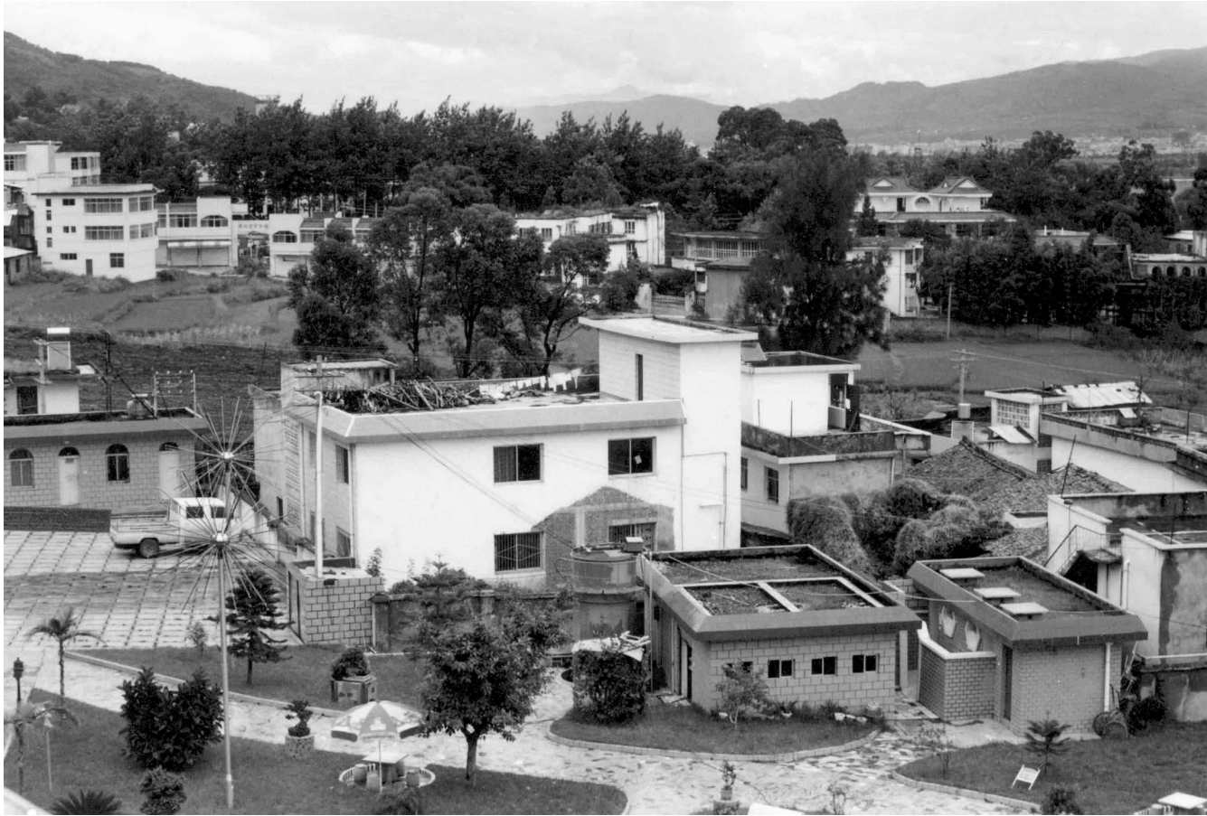
FIGURE 3 Hotels and restaurants built around Qionghai Lake to service the tourism industry are a source of wastewater pollution.

about 17 m. This means an accumulation of 3.4 m on the lake floor or an average of about 9–11 cm per year. Sedimentation from soil erosion and debris flows in Ezhang and Guanba subwatersheds has caused diminishing of the water surface and a decline in storage capacity.