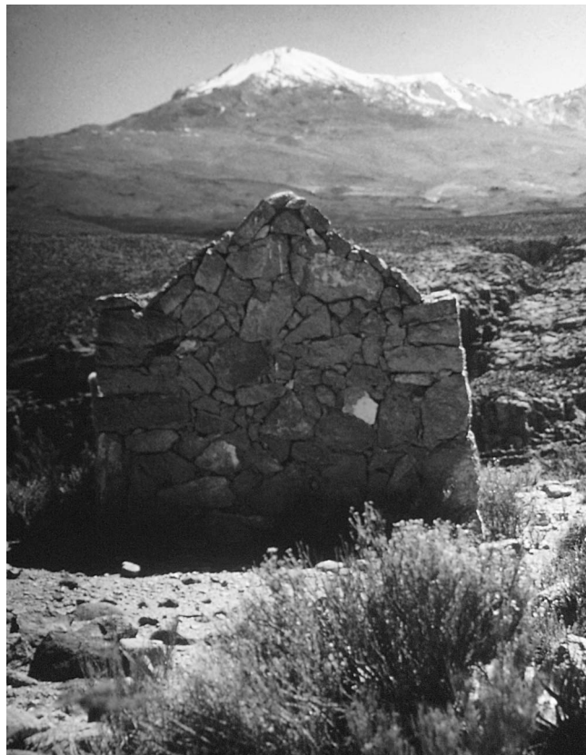
FIGURE 4 A 20th century chapel in the study area. Even modern religious structures such as this one are oriented toward the mountains.

that is revered in the region. The dead, as well as the cemetery structures for worshipping dead relatives, are laid out in the same way.