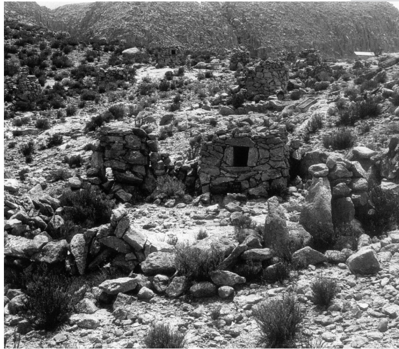
FIGURE 2 Ancient chullpa in Toconce, with a window opening out onto a sacred mountain.

this village. One is Q’aulor , a female hill that also bears the name of Sipitare Mama or Mama Sipaga . Her twin hill is Chita , a masculine hill, also called Sipitare Tata . They are considered partners or spouses.