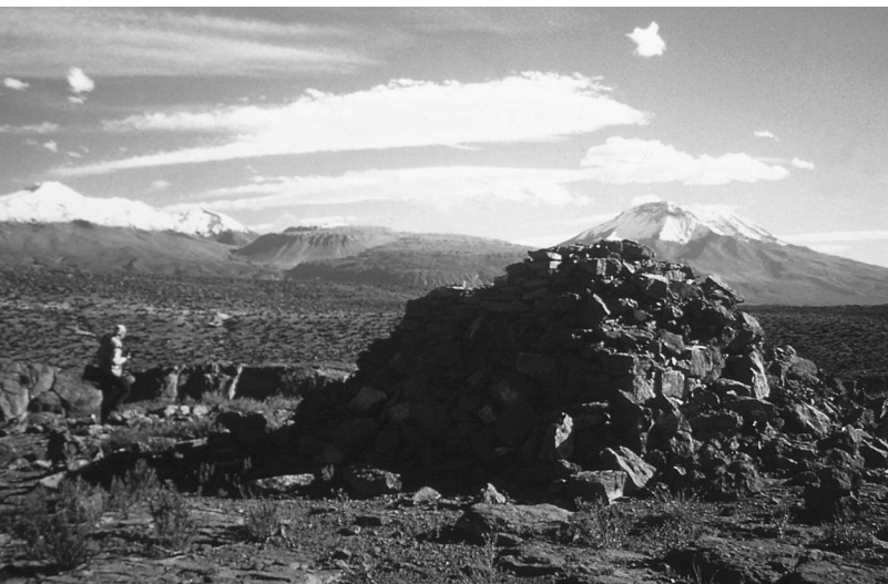
FIGURE 3 An Inca ceremonial ushnu in Cerro Verde, Caspana, oriented toward the mountains.

canyons of Atacama, where they are extremely relevant to the life of local inhabitants. A yatiri , or local sage of Toconce, pointed out to us that the earth is like a human being. The peña (rocks, hills) are the bones, the rivers are the veins the blood flows through, and the earth is the flesh. The deep places (caverns, caves, rocky shelters) and the ones that rise out of the earth (mountains, mounds, large rocks) are the achachilas , places of ancestral origin, inhabited by deities. The canyons, near the rivers and springs, are dangerous places. The juturi or sereno lives there, and when his sound or music is heard it attracts the unwary.