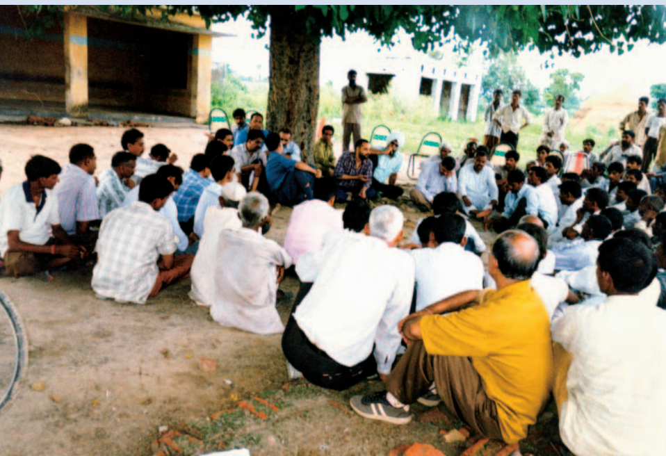
FIGURE 3 An ecodevelopment committee meeting in progress in a village adjoining the Rajaji National Park. Women generally do not participate, as is the case here.

“We will ensure the involvement and consent of the women of our region at all levels of decision making, while developing and implementing conservation and tourism plans.” (Statement in the Nanda Devi Biodiversity Conservation and Eco-tourism Declaration)