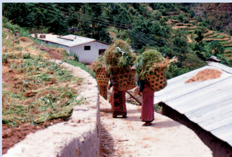
FIGURE 2 Women travel over treacherous terrain to fetch fodder, here in a village near Gangotri National Park, Western Himalaya.

Around 75 PAs have been created with the aim of conserving biodiversity and the fragile Himalayan landscape (see Figure 1). However, the Himalayas are a region where people depend most on natural resources, particularly for fuel, fodder, and thatch. In the past, hill people's dependence on forests was institutionalized through a variety of social and cultur-