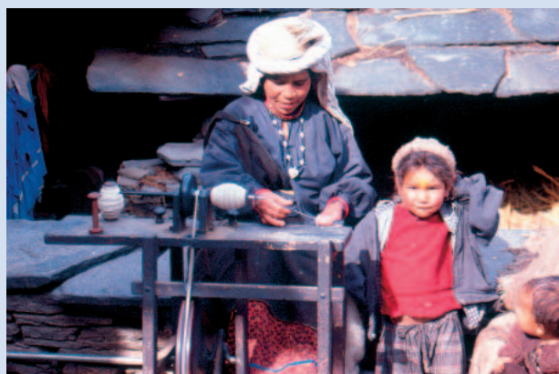
FIGURE 4 A Bhotiya woman spinning yarn in Lata village, near the NDBR. Women's activities are multifarious and allow them to adapt and survive under difficult and changing conditions.