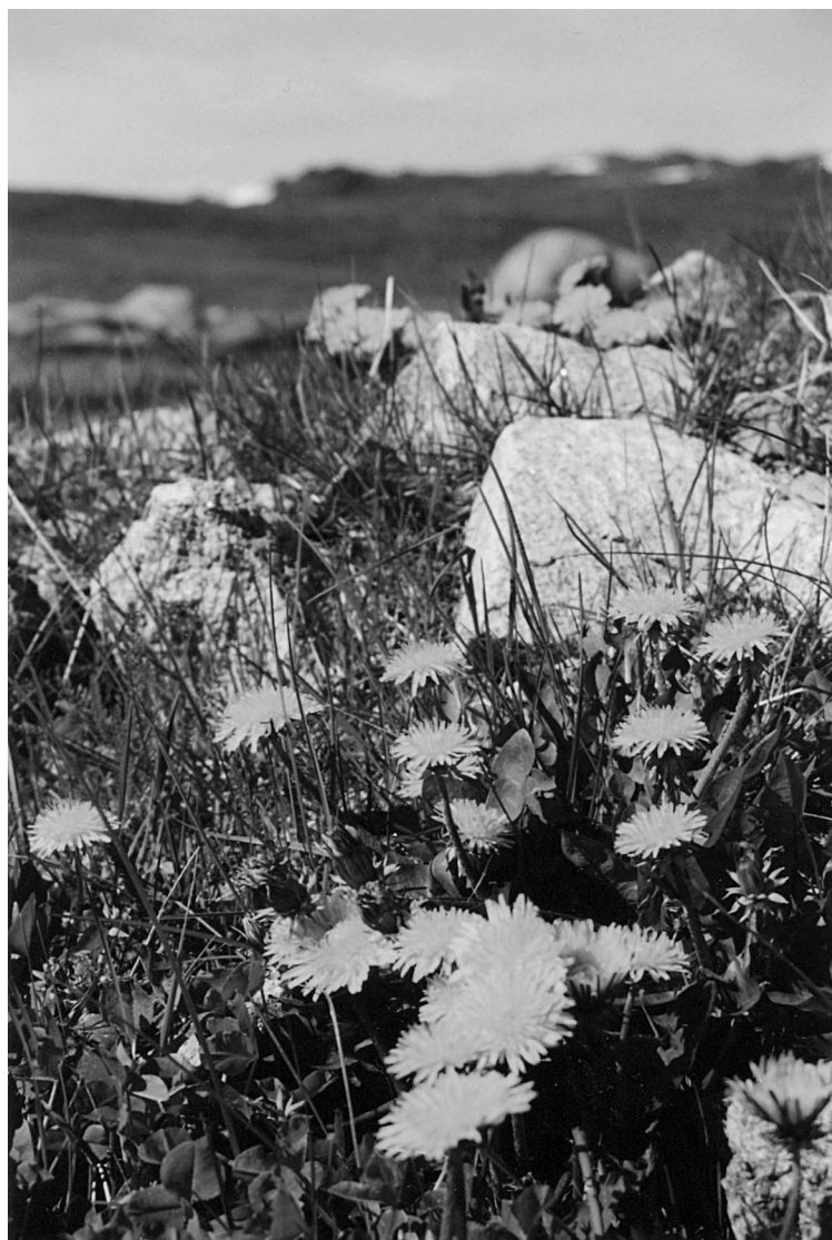
FIGURE 3 Dandelions ( Taraxacum officinale ) and clover ( Trifolium spp) growing along the edge of one of the gravel tracks near Mt Kosciuszko. Gravel track types often have a weed verge, whereas other track types, such as raised steel mesh walkways, do not provide weed habitat. Weeds are a problem in the alpine area; the diversity and abundance of weeds is likely to increase with predicted climate change.