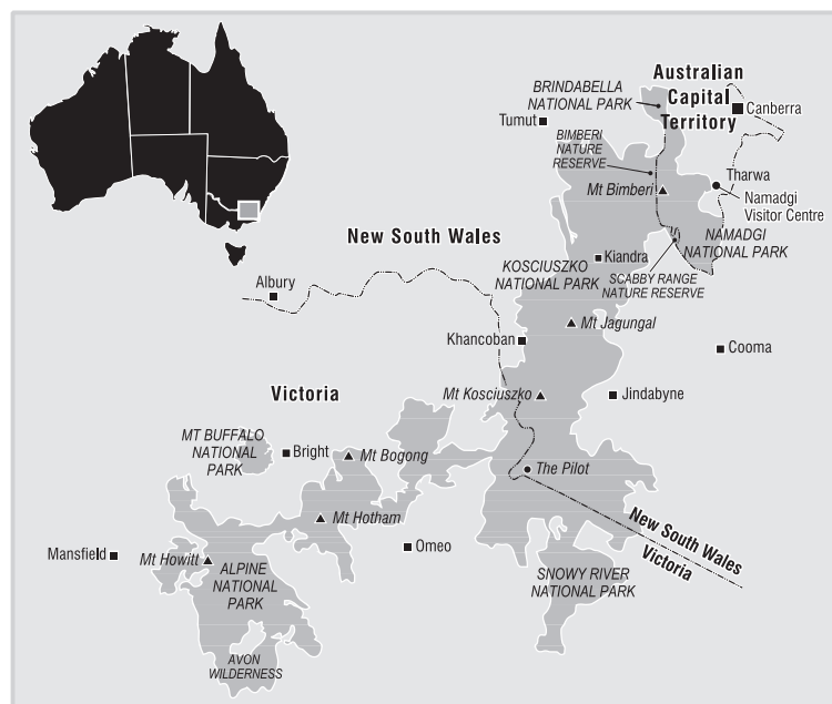
FIGURE 1 Australian Alps protected areas. Modified from AALC (1999).

Winter seasonal snow in Australia is restricted to the southeastern corner of the mainland and parts of Tasmania (Green and Osborne 1994). On the mainland, snow cover is regularly found only on a series of linked ranges and peaks known as the Australian Alps. The area is of outstanding biological importance, containing many endemic plants and animals as well as geological features of high conservation value (Mosley 1988). The protected area network of the Australian Alps includes Kosciuszko National Park, which contains the continent's highest mountain (Mt Kosciuszko, 2228 m), the entire alpine area, and most of the subalpine areas of New South Wales (Pulsford et al 2003). In Victoria, the high country is conserved in Alpine National Park, the Avon Wilderness, Snowy River National Park, and Mt Buffalo National Park (Figure 1; Pulsford et al 2003).