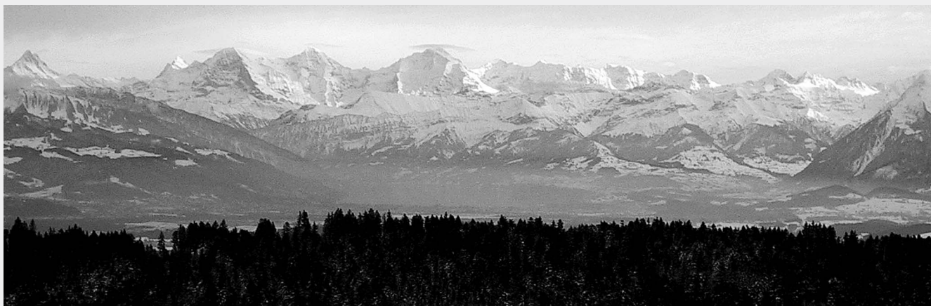
FIGURE 1 November snow on the Jungfrau–Aletsch–Bietschhorn World Heritage Site in Switzerland; view from the northwest.

UNESCO, Division of Ecological Sciences, Man and the Biosphere (MAB) Programme, 7 place de Fontenoy, 75532 Paris 07 SP France. t.schaaf@unesco.org