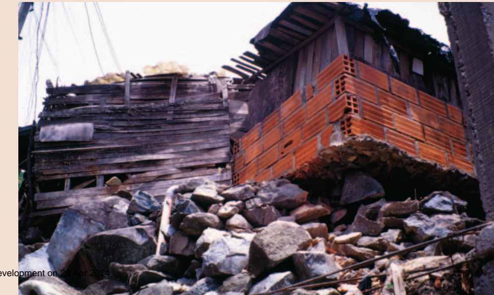
FIGURE 2 Use of land for spontaneous settlement, a problem being addressed by PRIMED in the so-called high-risk districts.

In the rich neighborhoods on the flat terrain of the valley, the response to scarcity of urban land and socio-cultural transformation was to increase the density of the built environment. Everywhere so-