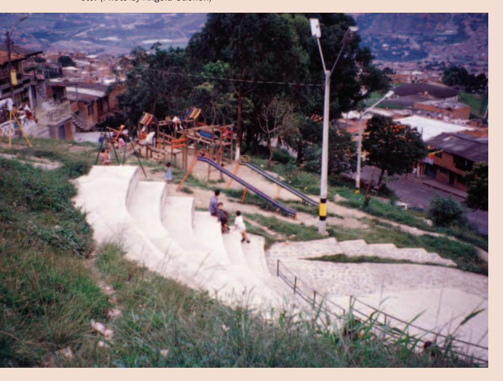
FIGURE 5 A new public area built by residents of the district. People in the PRIMED districts developed many ideas for open public areas: parks with benches, playgrounds for children, etc.

reflection among the community members. A member of a local grassroots organization put it this way: