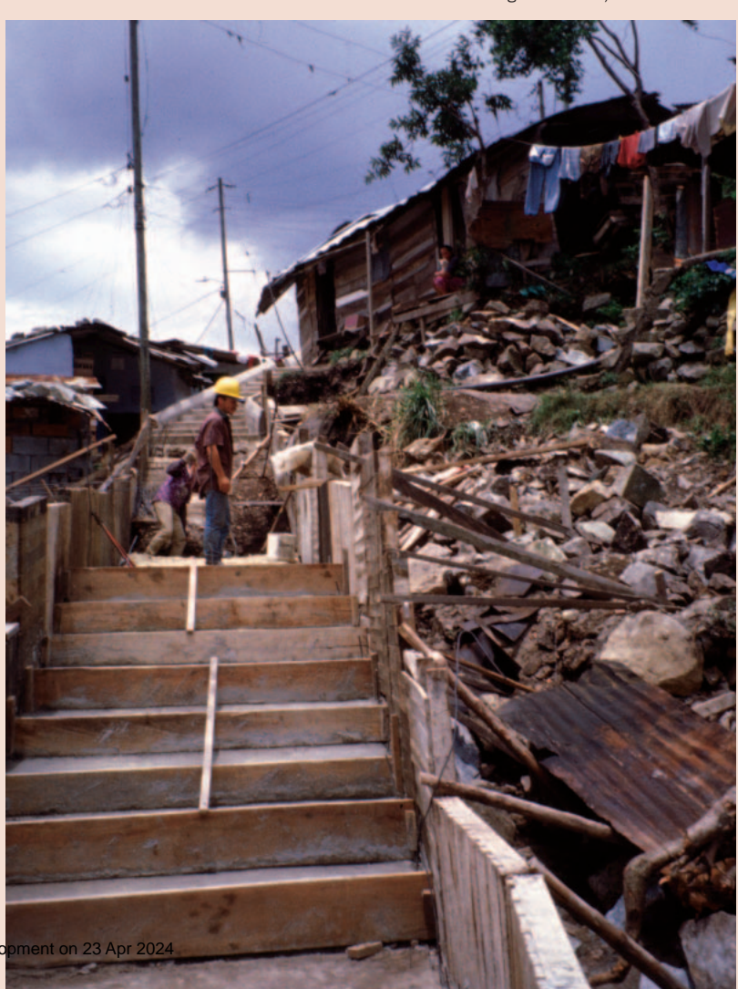
FIGURE 4 Participatory district improvement. Houses in the improved PRIMED districts are still only accessible by steps and paths due to environmental fragility. Residents continue to dream of driving cars to their homes, however.

An important strategy of PRIMED was to promote participatory local diagnostic and planning processes and management of projects by grassroots organizations in the neighborhoods. This was advocated in order to gain legal status and establish constitutionally determined conditions for negotiating project funding and implementation with the municipality, NGOs, and private actors. The local diagnostic and planning processes meant that inhabitants would traverse the neighborhoods, to socialize knowledge and construct a collective vision of the future (Figure 5). This generated important discursive public spaces in the districts, the outcome of which was a far-reaching potential for