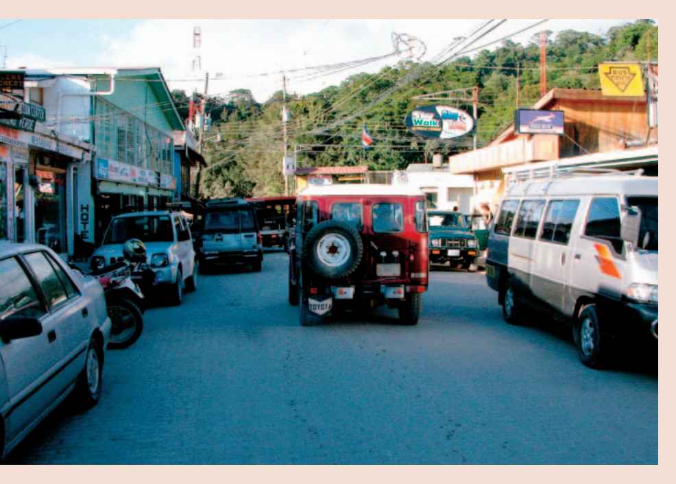
FIGURE 3 The main street of Santa Elena, clogged by tourist traffic that takes up too much public space.

major problem. This is aggravated by the location of the district in an area where 3 different municipalities converge, and by the administrative incompetence of Puntarenas, absorbed as it is by the problems of the central district.