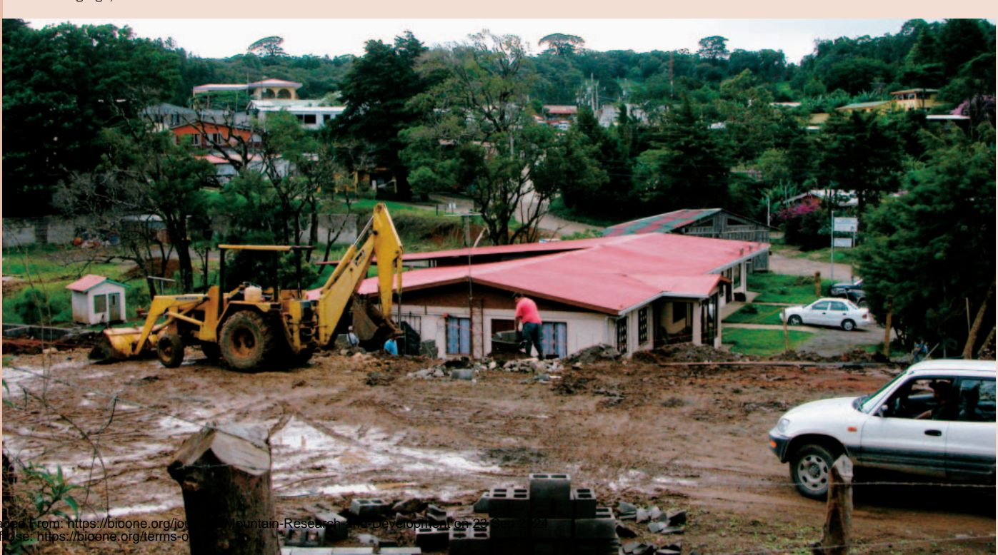
FIGURE 1 Uncontrolled urban development in the Monteverde area.

After Independence in 1821, agriculture and cattle breeding became Costa Rica's main economic activities. The first settlers in the Monteverde area—farmers from the Central Valley—arrived around 1920 and founded small settlements, taking advantage of the fertile and unexploited land in this mountain area. Thirty years later, Quakers from the USA established a