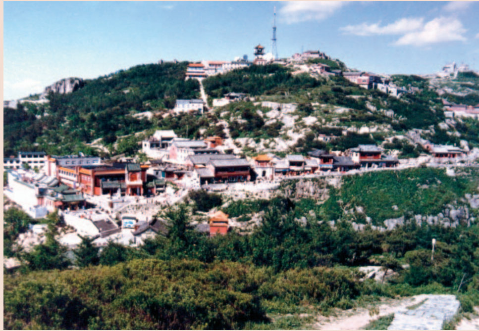
FIGURE 2 Sprawl of tourism facilities on the Yuhuang peak of Mt Taishan.

In recent years, average per capita income in China has increased rapidly, from about US$450–500 in 1990 to US$1000 in 2001, with peaks in cities and towns where many families now earn US$10,000 and more. People can therefore afford to travel within China and even abroad, especially during the 3 long holiday periods, also called the 3 golden weeks. Since 2000, holiday tourism has increased at a tremendous pace, leading to overcrowding (Figure 2). For example, Tibet recorded 686,000 tourists in 2001, 28.6 times more than in 1990. The Wulingyuan (Zhangjiajie) World Natural Heritage Site in northwestern Hunan Province—a typical tourist attraction—recorded 1.3 million tourists in 2002, compared with only 0.23 million in 1998 (Figure 3). Generally, the number of domestic tourists in mountain resorts has more than quadrupled in the last 5 years in China.