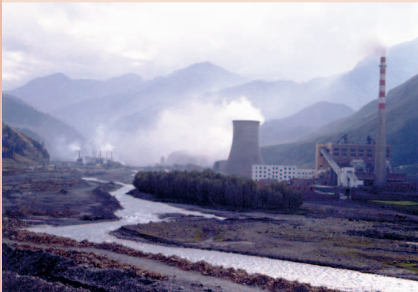
FIGURE 1 Cement plant built in the early 1970s in the mountains south of Urumqi, Xinjiang. The plant provided more than 300 local jobs but is the source of uncontrolled pollution. Distance from the city means there is lack of awareness of this negative impact.

The urbanization process has brought many problems. One is the emergence of landless peasants—a rapidly expanding and weak social group. Indeed, large-scale urbanization has led to confiscation of large areas of farmland. Although local governments have occasionally provided some compensation, the amount is usually very limited. In some cases, land was the farmers' only source of livelihood; they have become homeless, jobless, and in some cases have lost hope. Another problem is the helplessness of many peasants who leave their home towns in search of casual labor in the cities, but with almost no assurance of income and decent health. These people are the victims of urbanization.