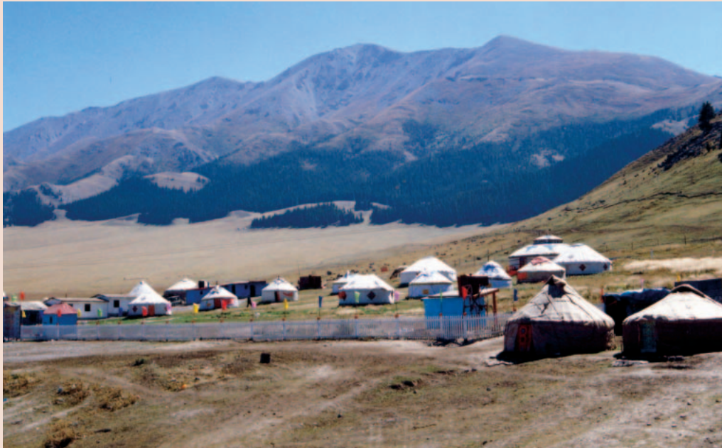
FIGURE 5 More sustainable tourist accommodations built by local people near Sayram Lake, in the Tien Shan; there are no permanent structures around the lake. Damage to the ground from tourist use can be repaired.

stand the significance of protecting world heritage sites and parks in mountains. Specialists, eg Xie Ninggao (Peking University) and Li Jisheng (Shandong Province), have revealed the problems of over-urbanization and landscape damage in mountains, and appealed for measures and actions to halt careless behavior. International pressure has forced some local governments to invest large sums to remove hotels and even local residents from scenic spots. In some areas, more sustainable tourism has been initiated (Figure 5).