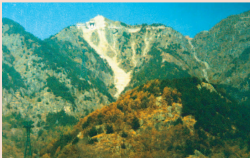
FIGURE 4 Scar (15,000 m 2 ) left by construction of a cable car on the Yueguan peak of Mt Taishan.

connected with the management of parks and heritage sites, with no clear aims and measures. Management of world heritage sites and parks is actually left to local governments, which, in turn, usually rent them to tourist corporations.