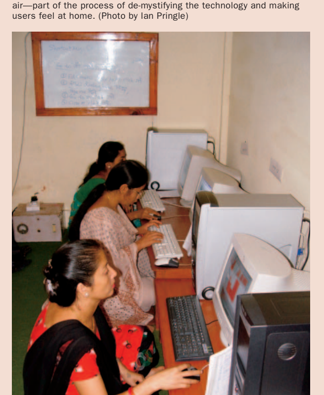
FIGURE 5 Housewives taking a computer course at the CMC in Tansen. Drawing on tradition and saving on furniture costs, the CMC set up computers on low tables so that users could sit on cushions on the floor. The arrangement helps to give the center a less formal

The CMC is introducing a membership system through which community members and volunteers are able to use the computer and Internet facilities. The team plans to expand the hours of cablecast programming to increase viewership and hopefully community support. The Local Programme has started to carry some small advertising with spots made by youth volunteers. The CMC offers paid video and production services for local weddings and other ceremonies. Youth who do the video shooting split the NPR 2000 fee (about USD 25) with the center. The CMC charges NPR 750 to mix wedding video footage. The center has started to offer limited, low-cost training programs. For example, 30 housewives are paying an average of NPR 900 (about USD 12) for a three-month course covering basic computers, word processing and Internet (Figure 5). The CMC is also planning to introduce on-demand music and video features for cable subscribers.