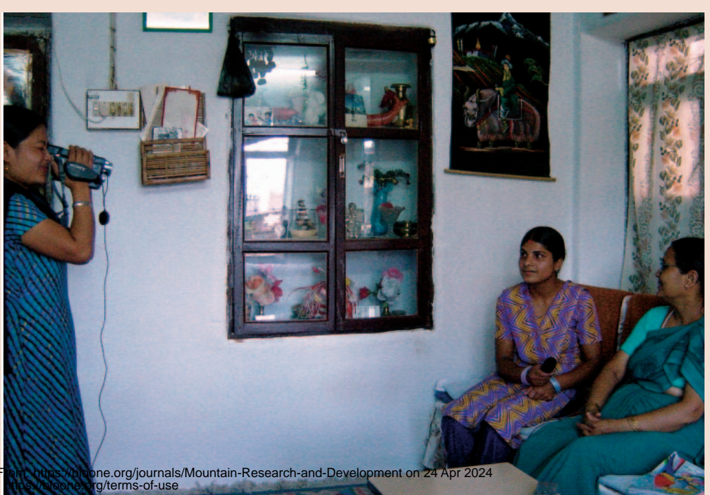
FIGURE 4 Two young producers film and conduct an interview as part of Jeevanko Goreto (Path of Life). The CMC's focus is on youth, and young women constituted a majority of the 174 participants that the CMC trained in the first year of the program.

Direct access to the Internet is also opening up new ideas and spaces for exploration. After a computer training program for 30 housewives, a handful of women have started using email to keep in touch with family members abroad. They also search the Internet for new recipes and hair styles to put to use in small businesses. To address the lack of good materials available in masters-level programs, the CMC is introducing a specialized course for local campus lecturers on searching and using the Internet.