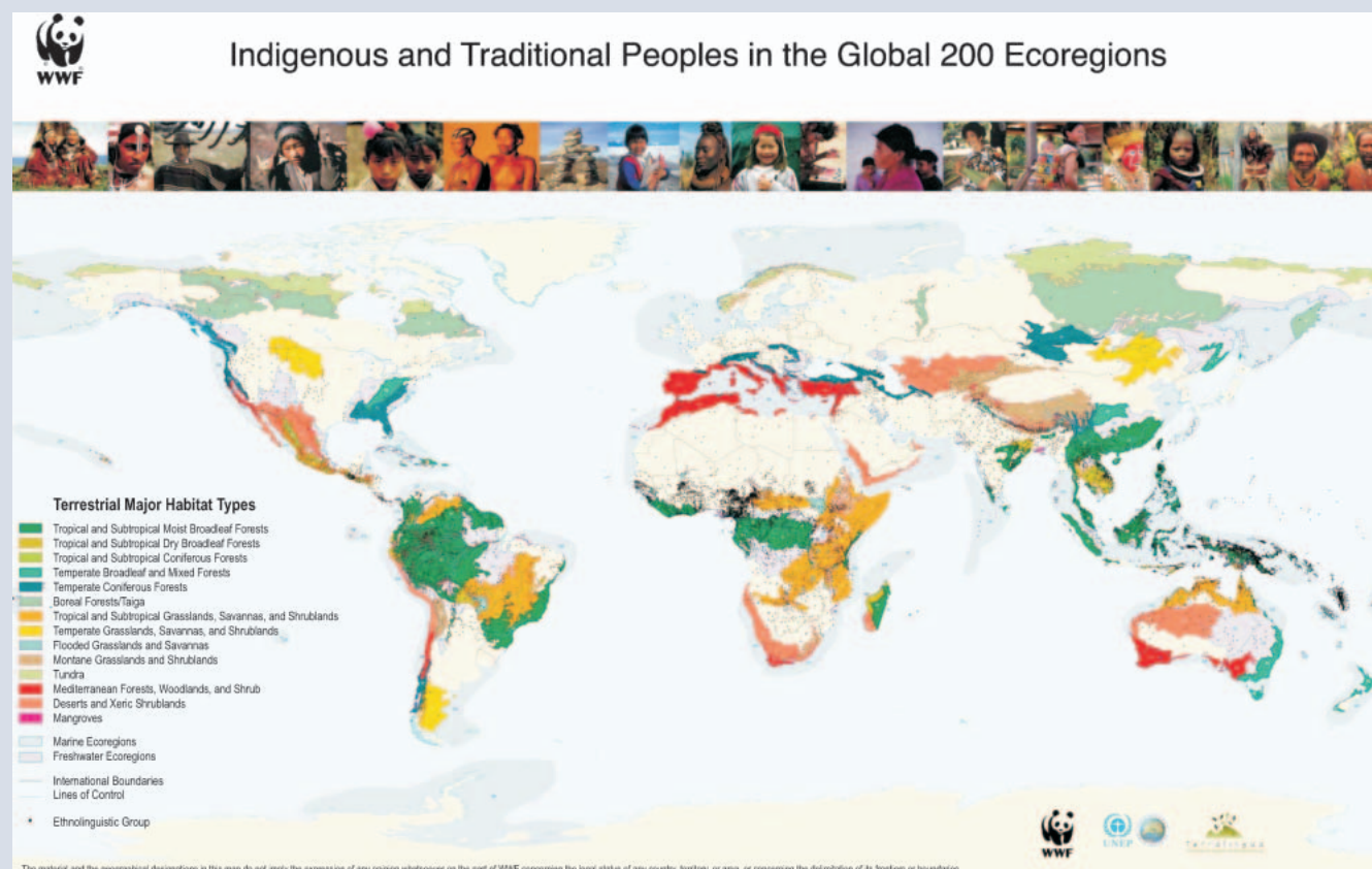
FIGURE 5 The result of a major effort to map biocultural diversity: an online map of the “Indigenous and traditional peoples in the global 200 ecoregions.”

power of speakers of endangered mother tongues, to give the language a strong presence in the education system and to provide the language with a written form to encourage literacy and improve access to electronic technology. Linguistic diversity is, after all, the human store of histori-