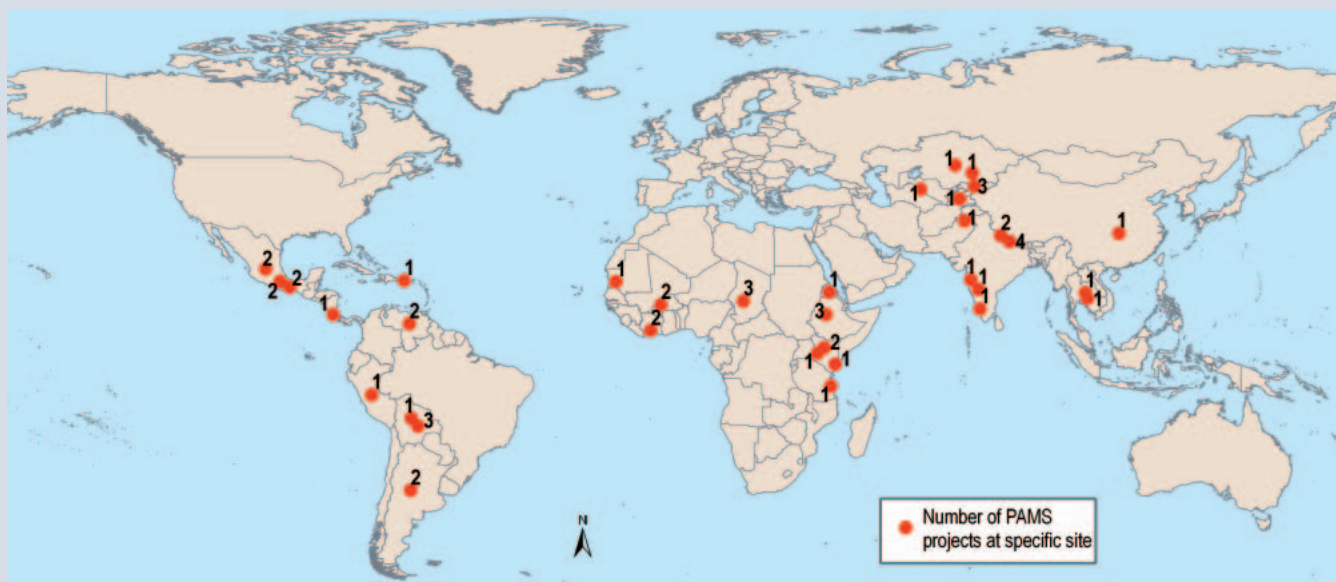
FIGURE 2 Location of completed and on-going PAMS (2002–2005). 55 PAMS have been approved to date, of which 12 are located in a mountain area or highland–lowland context.