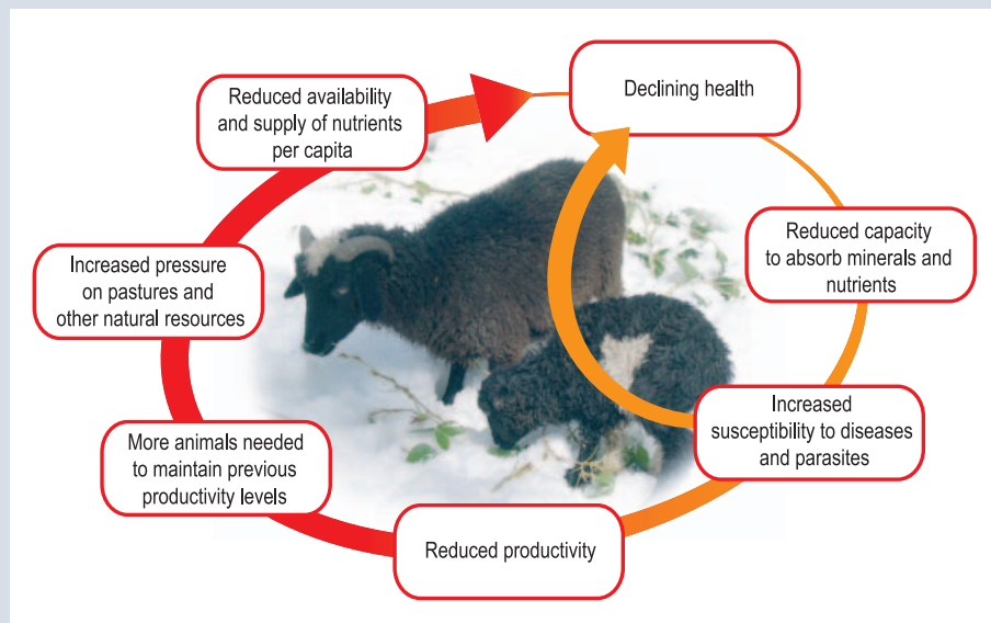
FIGURE 5 Vicious cycle(s) affecting small ruminants in the Hindukush mountain range. Here: a ewe and her lamb in Rabat, Arkari, October 2004.