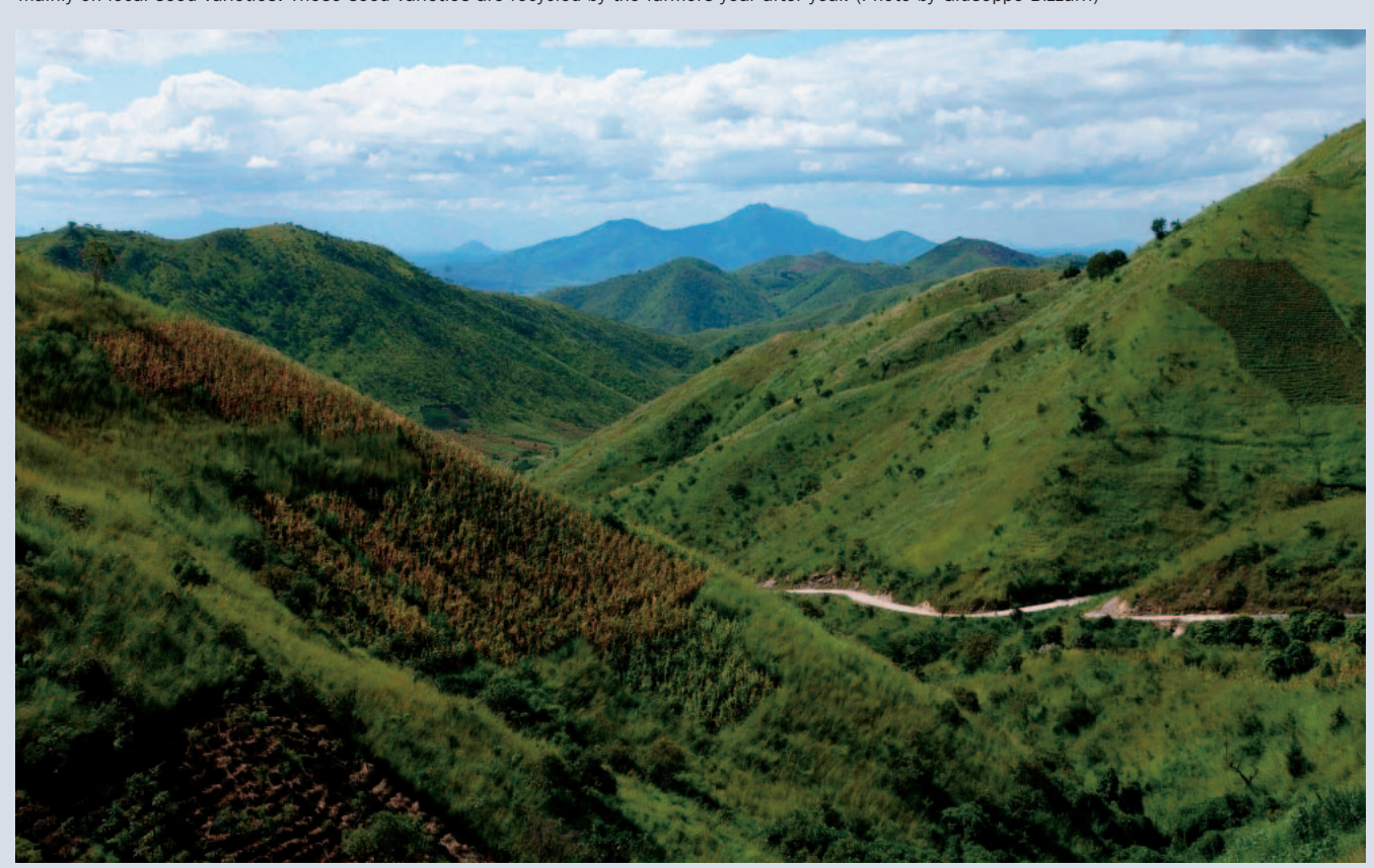
FIGURE 2 The agricultural production of farmers living in the fragile ecosystems of the Southern Highlands and the Central Zone of Tanzania depends mainly on local seed varieties. These seed varieties are recycled by the farmers year after year.

preservation, and storage technologies. Such knowledge, which has been accumulated over millennia, is fundamental for food production and the development and adoption of coping strategies during food shortages and in times of hardship.