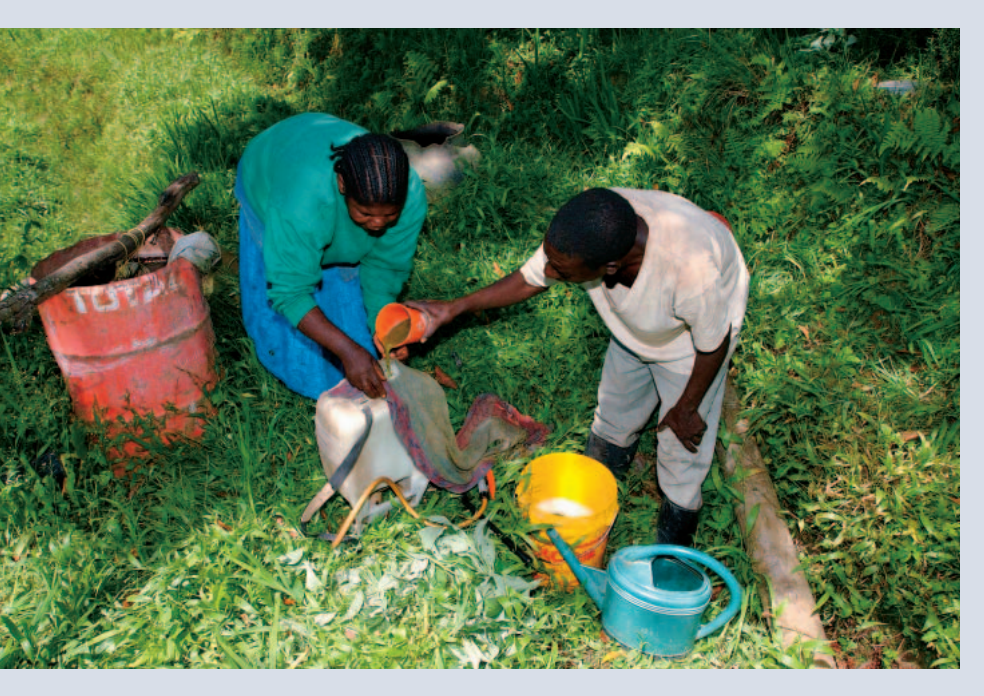
FIGURE 3 Farmers preparing a local pesticide from leaves and stems of selected plants to spray on vegetables in Mgeta village, Morogoro region, Tanzania.

eat the seeds that they planned to keep for the next planting season. However, without seed there will be no crop, and the cycle of seed recycling as well as closely related knowledge will be endangered. Other risk factors are outside influences on rural communities that lead to changed interests and attitudes on the part of the younger generation. The example of the disappearance of the castor oil crop from some of the Southern Highland villages highlights how fragile these systems are.