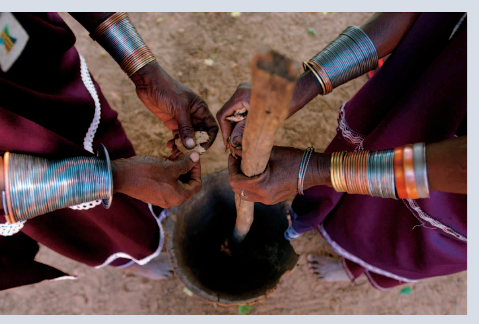
FIGURE 5 Women and men farmers have an enormous wealth of knowledge about how to treat their animals with medicine made of local plants. Pieces of mkunde kunde bark are pounded into a powder and mixed with water to cure animals of infestation with worms.

"We hope the next generation will integrate the best of the modern with the best of tradition." (Masaai herder)