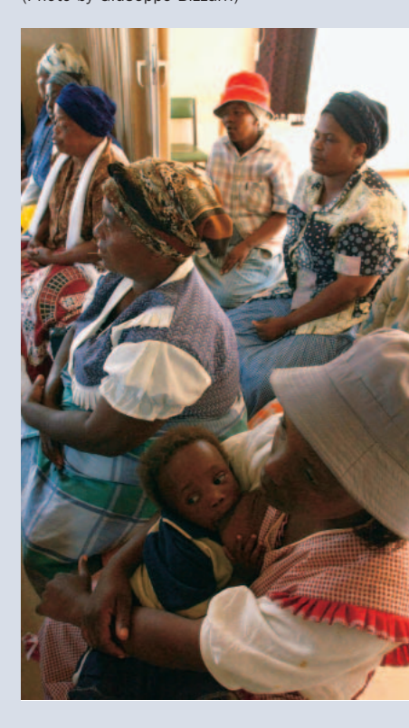
FIGURE 4 Women participating in a workshop discuss local seed varieties.

Due to workshops and intensive collaboration between many national partner institutions, an increasing interest in local knowledge was observed in Tanzania. Based on a stakeholder workshop, several institutions—the Commission for Science and Technology (COSTECH), the Tanzania Food and Nutrition Centre (TFNC), the National Environment Management Commission (NEMC), the University of Dar es Salaam, and the National Institute of Medical Research (NIMR)—formed a