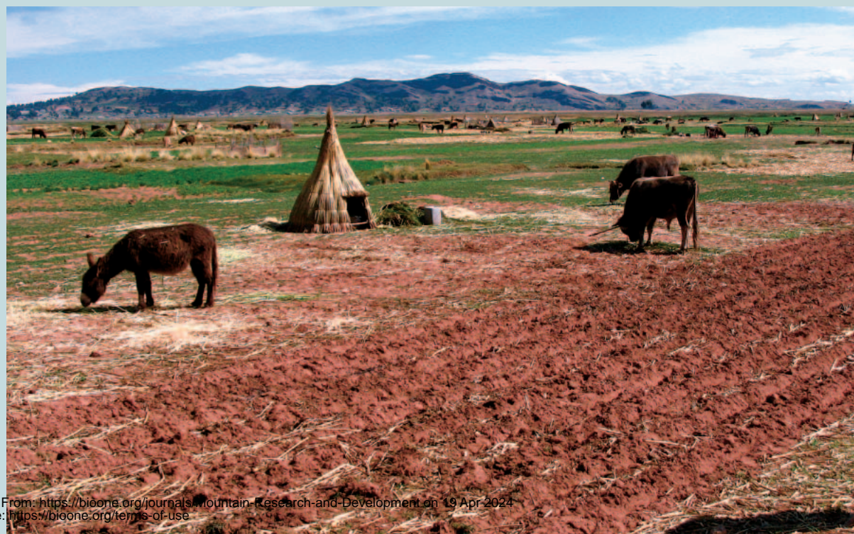
FIGURE 1 The centuries-old land use system developed by the indigenous communities on the Altiplano combines crop and livestock production.

During the last two decades, the International Potato Center (CIP) and its part-