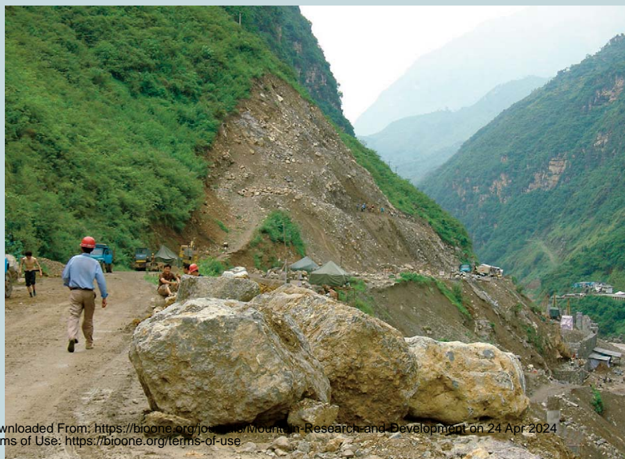
FIGURE 4 Environmental impacts of hydro-project road building in Zhaotong City.

land surface), steep slopes (nearly half the land has gradients higher than 25^\circ ), high precipitation (over 1000 mm), and widespread cultivation on sloping land (more than 70% of its farmland is on steep mountain slopes). This has induced serious soil erosion (Figure 3). More than half (52%) of the land surface suffers from soil loss, and 57% of the area affected has heavy ( 5000\text{--}8000\text{ t/km}^2 ) or moderate ( 2500\text{--}5000\text{ t/km}^2 ) degrees of soil erosion.