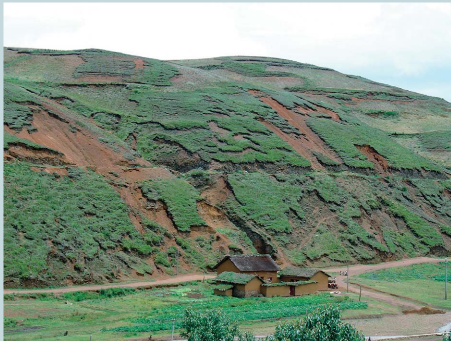
FIGURE 3 Slope farming and resulting erosion and land degradation processes in Dashabao, Zhaotong City.

ing national policy and the orders of higher administrative authorities. There is a saying in the local areas about the projects: “The country will get achievement, the enterprises will get benefits, the local government will get difficulties, and resettled migrants will get poverty.”