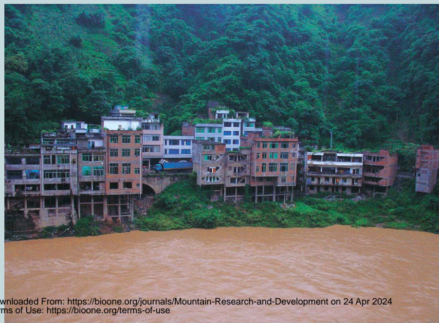
FIGURE 2 Buildings on concrete stilts show the extreme scarcity of flat land suitable for construction in the densely populated Zhaotong City area.

Theoretically, major investments due to hydropower projects should be a powerful driver in developing the local society and economy. Hydropower projects could provide local residents with clean energy, hopefully reducing forest logging, protecting the mountain ecosystem, and promoting the regional economy. Large water