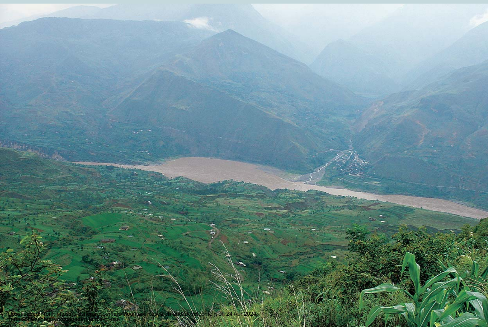
FIGURE 5 Resettlement of the rural population in areas such as this traditionally farmed landscape along the Jinsha River will cause social conflicts, especially as the local and district governments have little decision-making power vis-à-vis the state and the hydropower company. This calls for change at the policy level.

China issued exclusive regulations for the resettlement of people affected by the Three Gorges project, which effectively helped solve problems raised in