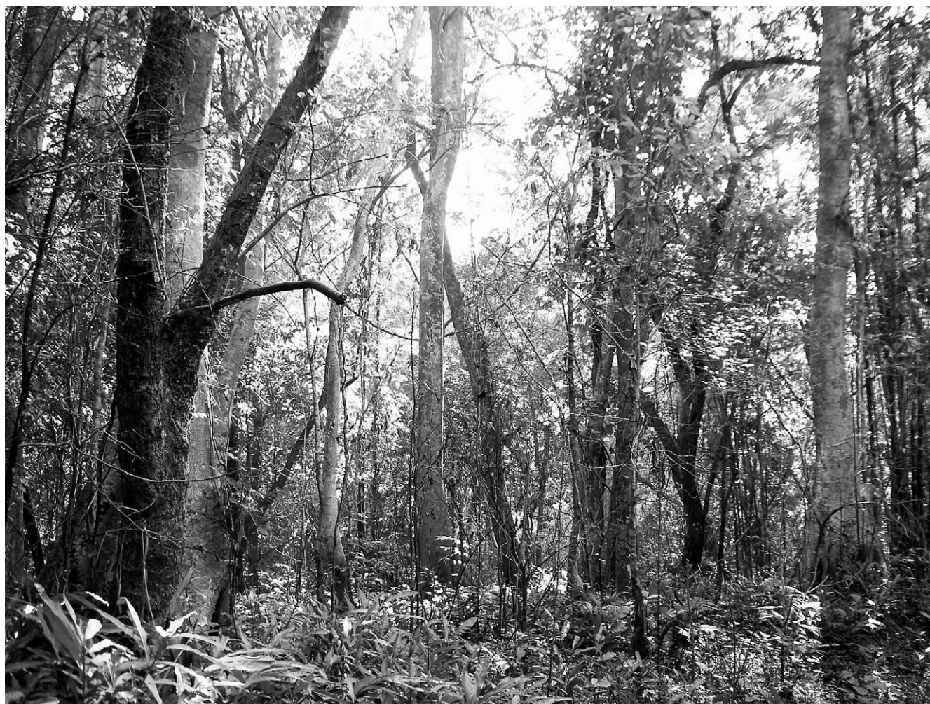
FIGURE 3 An example of the mae la thei kla forest type in the Pwo Karen classification system.

called mae la bon peuh (or mae la bon lo , or also mae la bon ). However, there were some disagreements over the number of years a forest has to be left fallow to be called hui peuh , mae la hui bon , mae la bon peuh , or mae la lom boh .