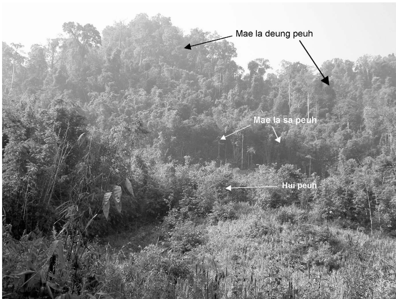
FIGURE 2 Three different forest types on a kon lo (mountain): mae la deung peuh , mae la sa peuh , and hui peuh .

the forested tract since it was last cut and burned for cultivation. Terms are given to patches of forest primarily according to their stage of vegetation growth. The terms are related to the length of time a patch of forest has been left fallow, and whether it is ready to be cut and burned again for farming, or whether it is too old to be cleared and farmed.