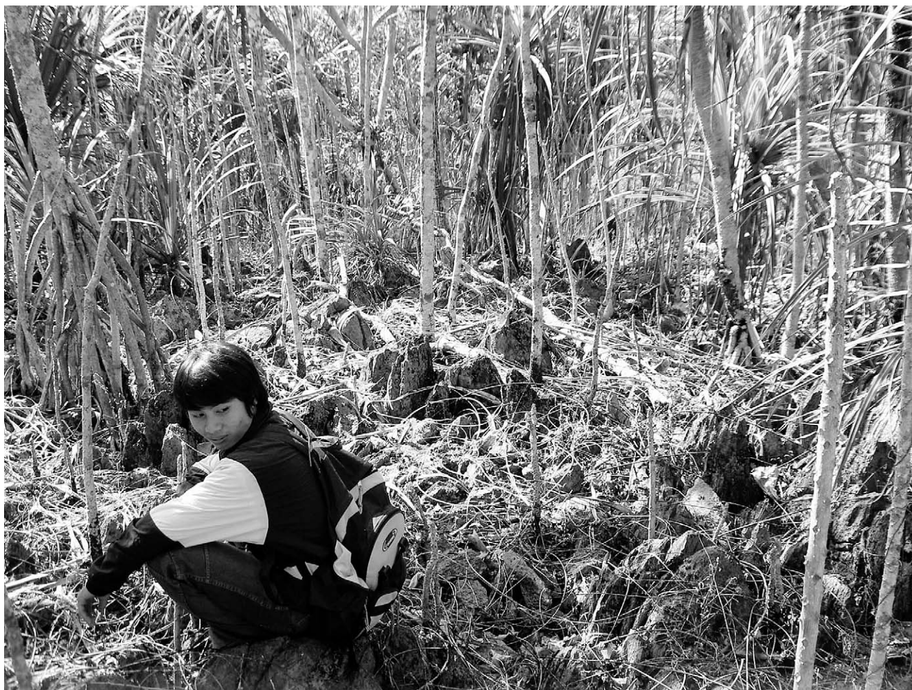
FIGURE 5 An example of the lai kla forest type in the Pwo Karen classification system.

slope. The forest categories here are more akin to the ecological zones or habitats found in international conventions, with some variations.