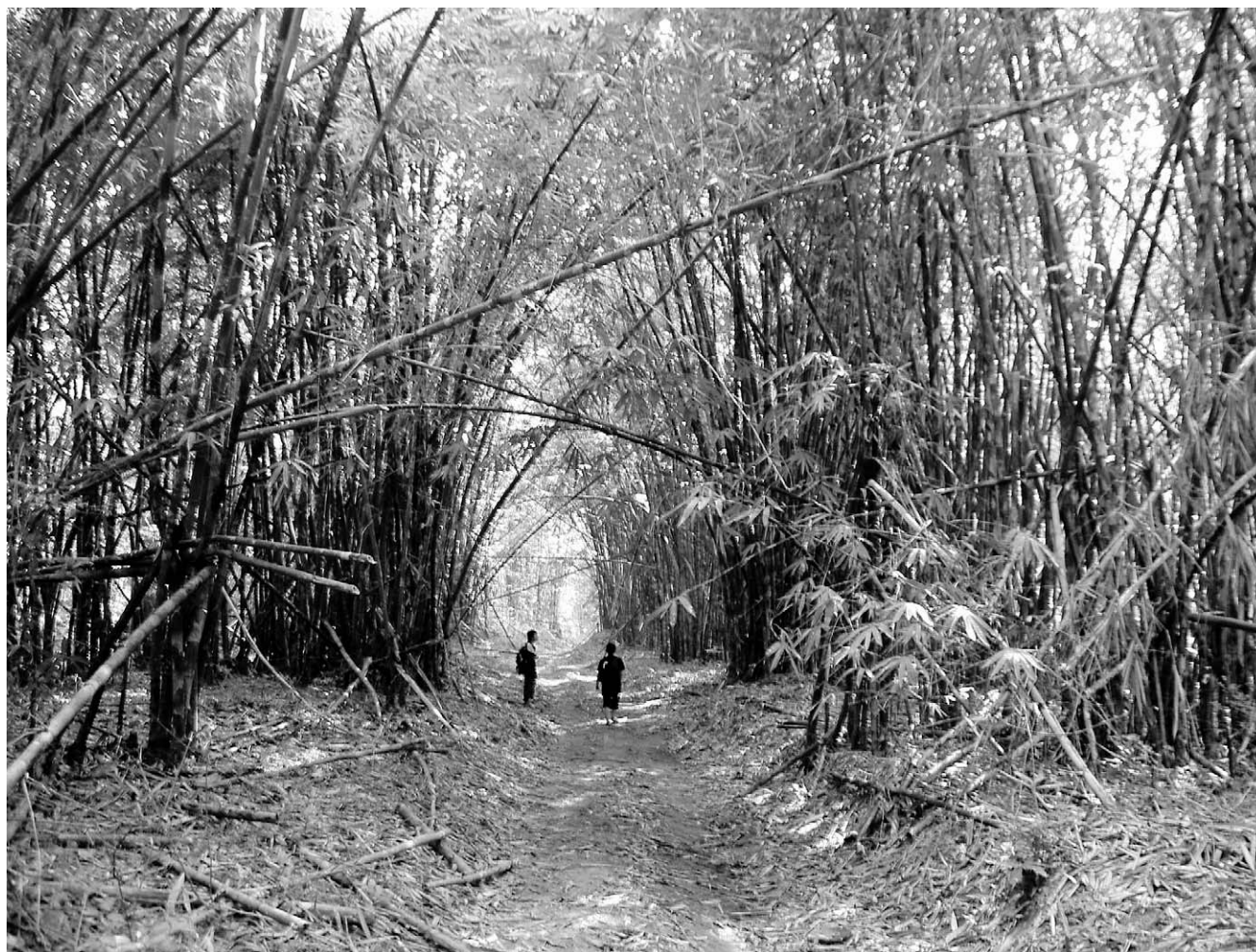
FIGURE 4 An example of the mae la wa kla forest type in the Pwo Karen classification system.

not fell the trees in mae la thei kla for farming purposes. This forest type is older than sa peuh , but younger than the oldest-growth forest in the classification: deung peuh .