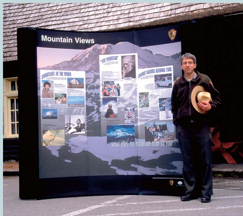
FIGURE 3 Mount Rainier traveling exhibit.

The exhibit has 3 sections: "The Mountain," "Mount Rainier National Park," and "Mountains of the World." Each section employs images of people with