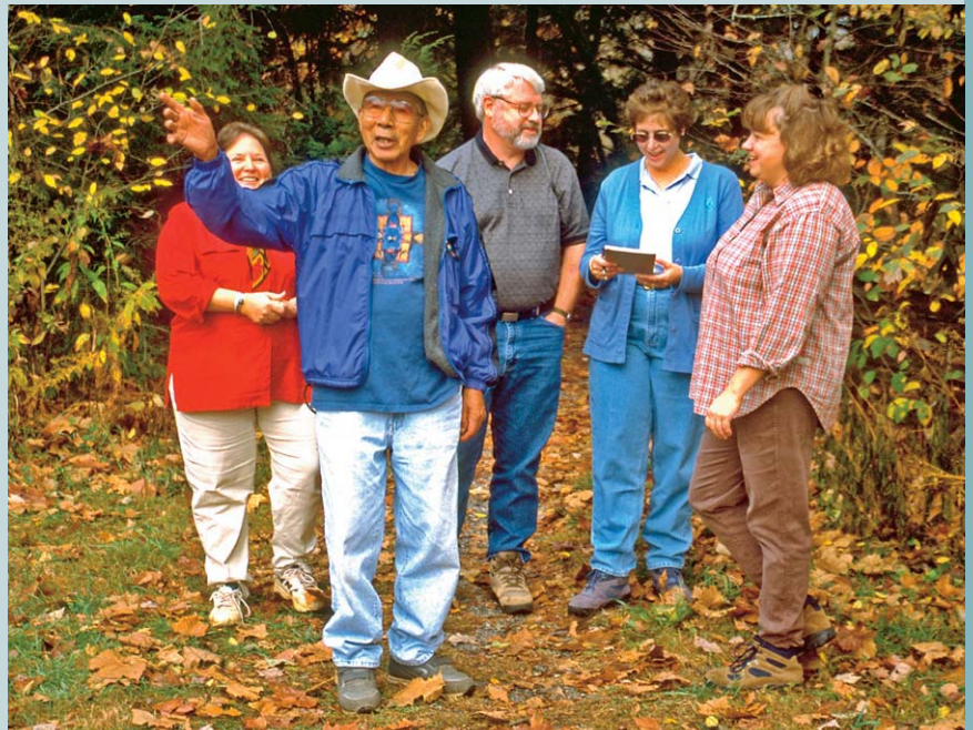
FIGURE 5 Cherokee elder pointing out buzzards on the Oconaluftee River Trail.

for a wide variety of people and groups, ranging from small to large. Many, such as the San Francisco Peaks in Arizona or Ausangate in Peru, are important primarily to local communities or indigenous peoples. Others, such as Kailas and Sinai, have regional, national, or even international importance. They may be revered by the people of an entire nation or by a major religious tradition with adherents around the world, such as Christianity, Judaism, and Buddhism. Similarly, caretakers and custodians of mountains and mountain sites may be local or they may come from far away or belong to a religious order responsible for many different shrines. Efforts to conserve the environmental integrity and cultural diversity associated with sacred mountains need to take into account and involve the many diverse peoples and traditions that revere and care for them.