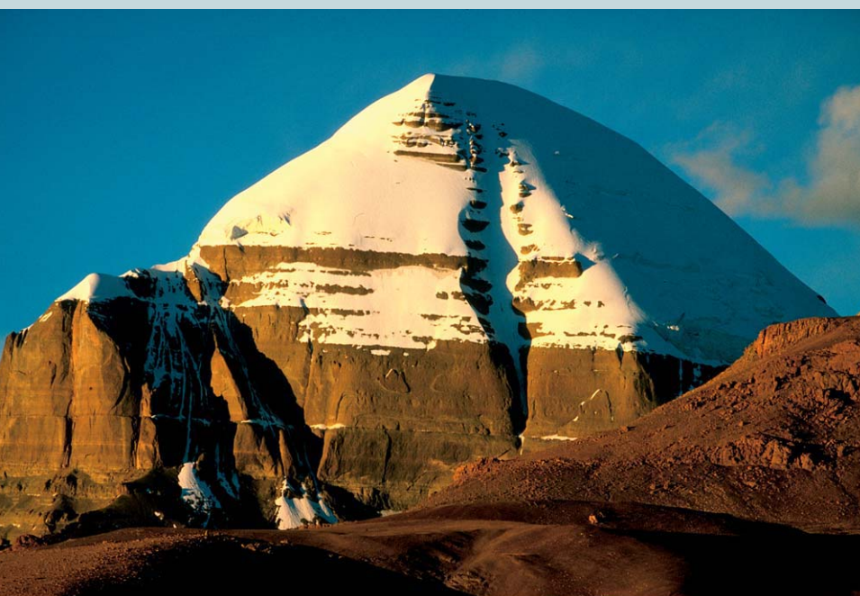
FIGURE 2 Mount Kailas, Tibet.

Deity or Abode of Deity. The power of many sacred mountains derives from the presence of deities—in, on, or as the mountain itself. Indians regard the graceful peak of Nanda Devi, a World Heritage site, as the abode of Nanda Devi, the Goddess of Bliss. A temple at the hill station of Almora has a well-known image of the deity. Native Hawaiians revere Kilauea itself as the body of the volcano goddess Pele.